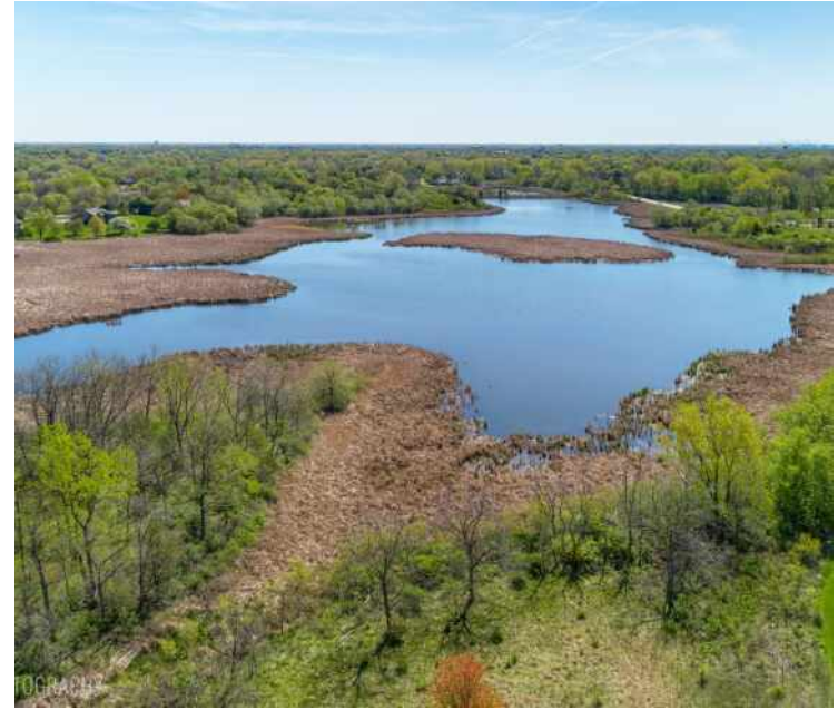
AERIAL VIEW / CONSERVANCY