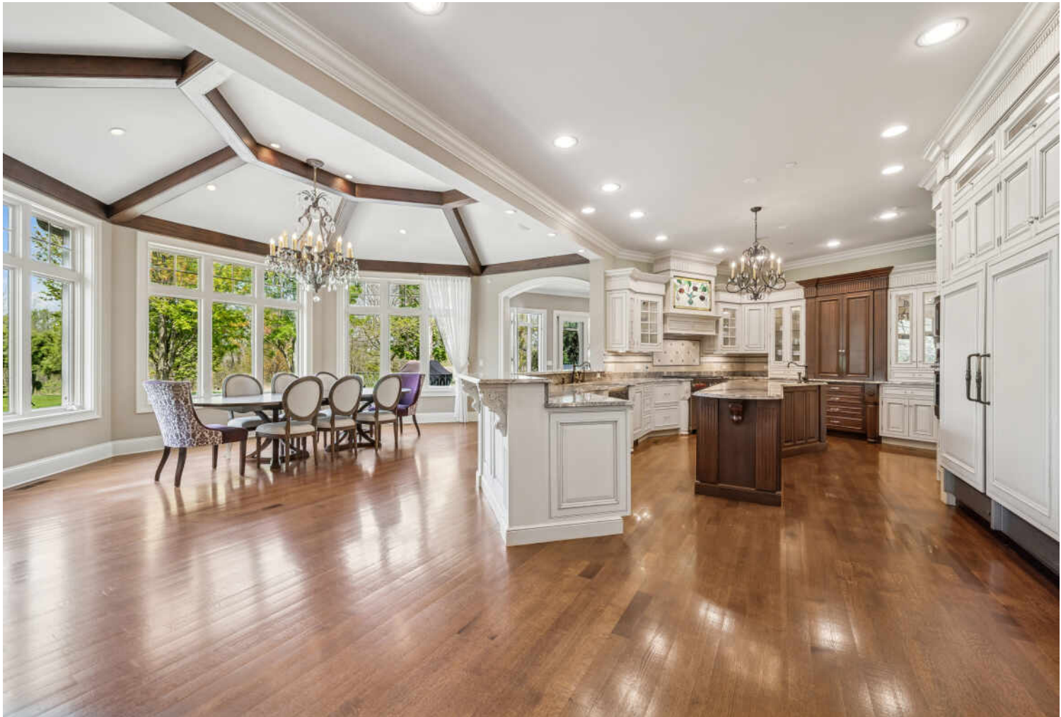
KITCHEN / BREAKFAST ROOM