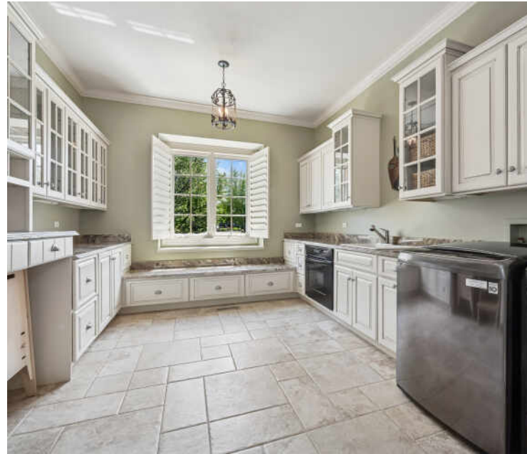
WALK-IN PANTRY / PREP KITCHEN / LAUNDRY