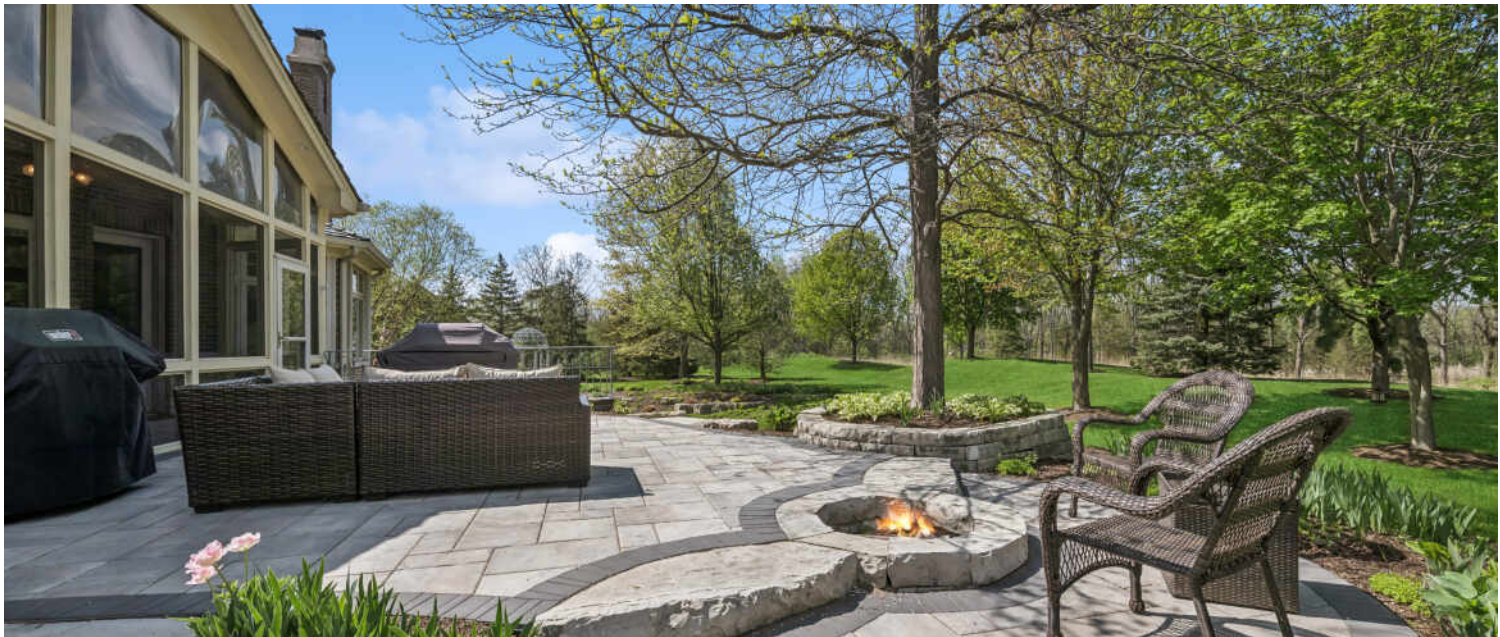
PATIO / FIRE PIT