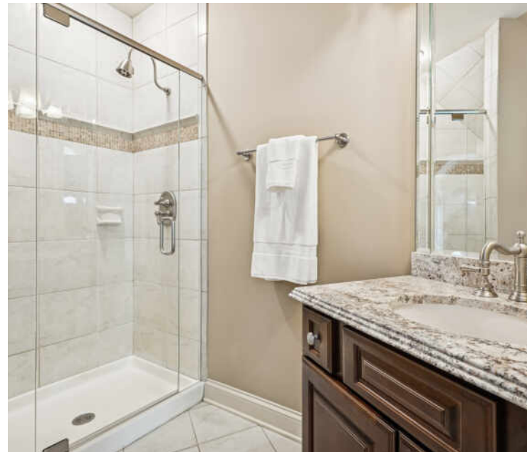
3RD BEDROOM ENSUITE BATH