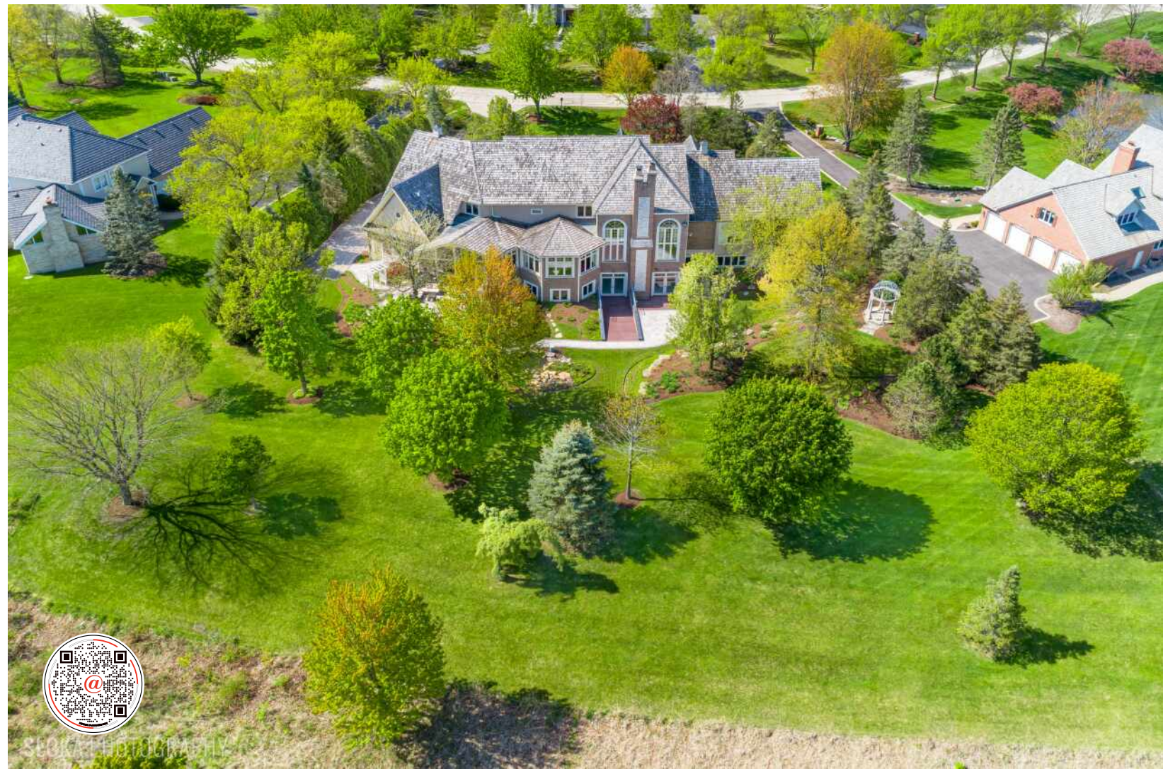
55 NEW ABBEY DRIVE INVERNESS