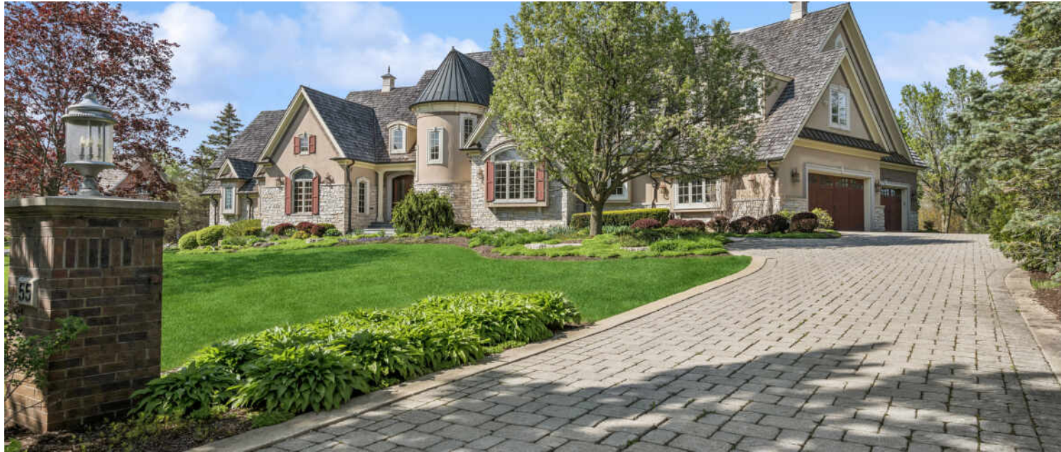
SIDE VIEW / GARAGE