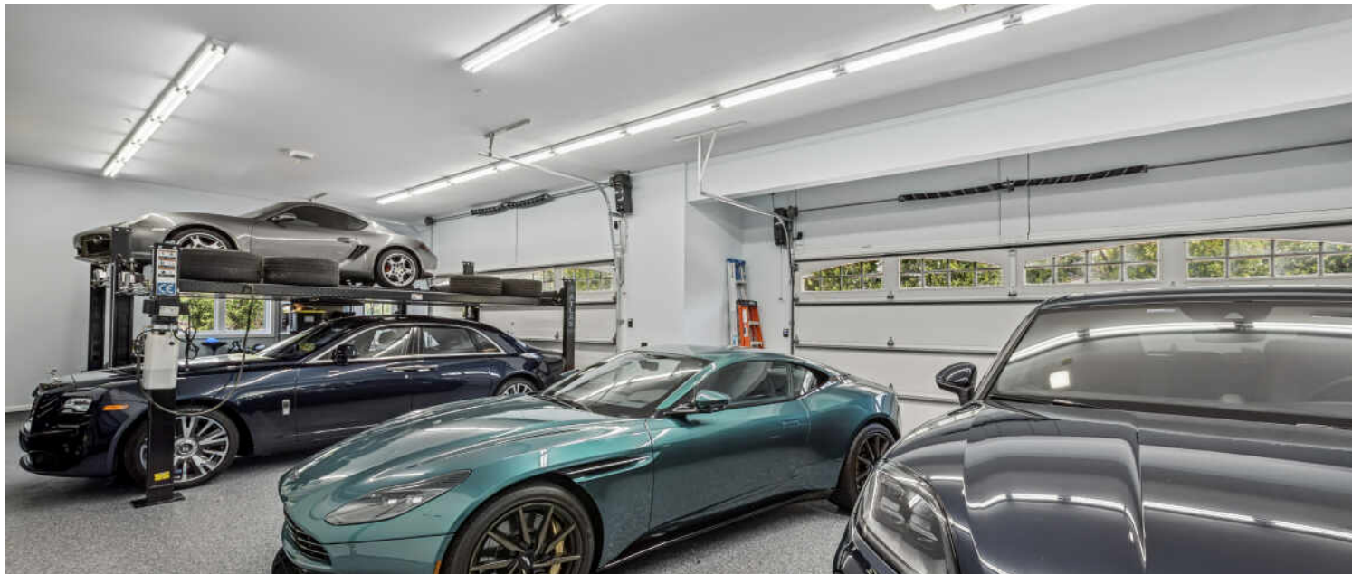
GARAGE WITH LIFTS