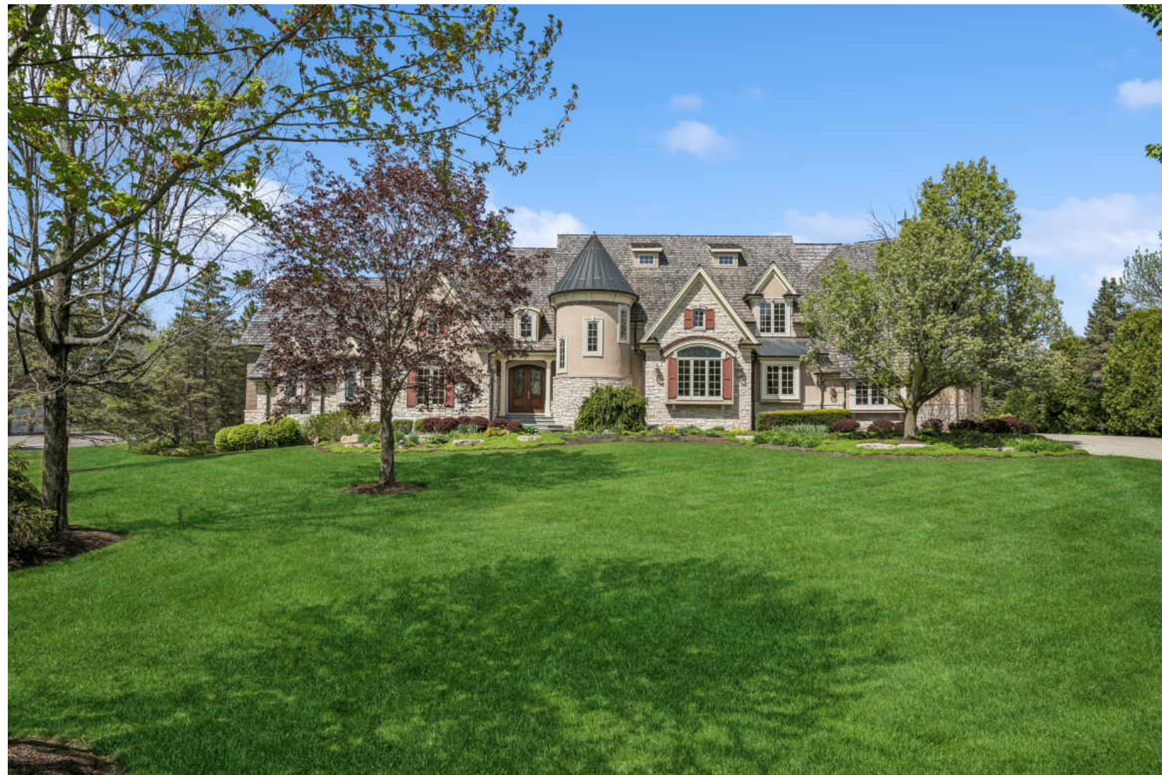
55 NEW ABBEY DRIVE • INVERNESS

@properties | CHRISTIE'S INTERNATIONAL REAL ESTATE