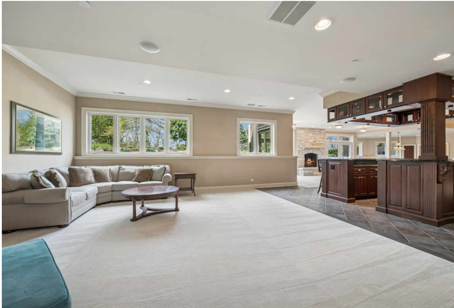
LOWER LEVEL FAMILY ROOM