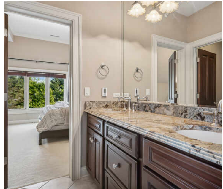
4TH & 5TH BEDROOM SHARED BATH