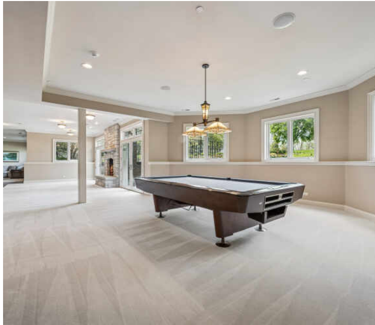
GAME / BILLIARD ROOM