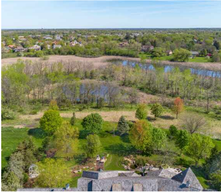
AERIAL VIEW / CONSERVANCY