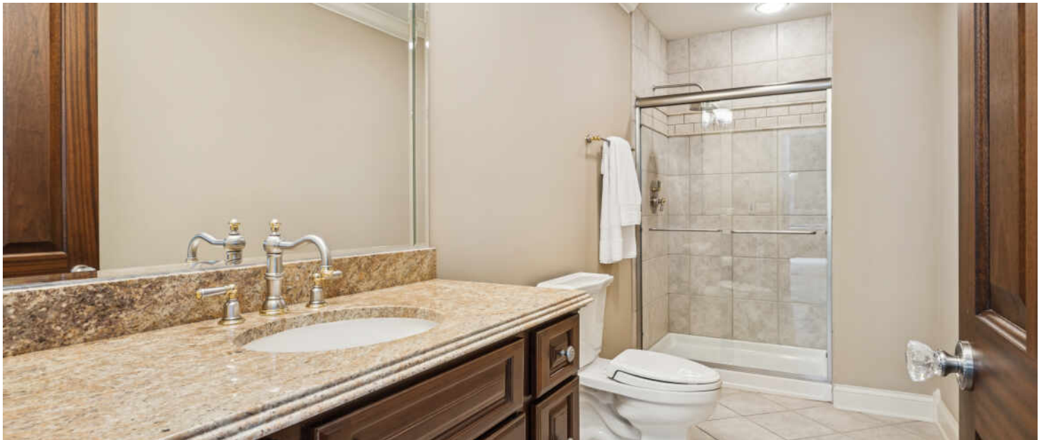
LOWER LEVEL FULL GUEST BATH