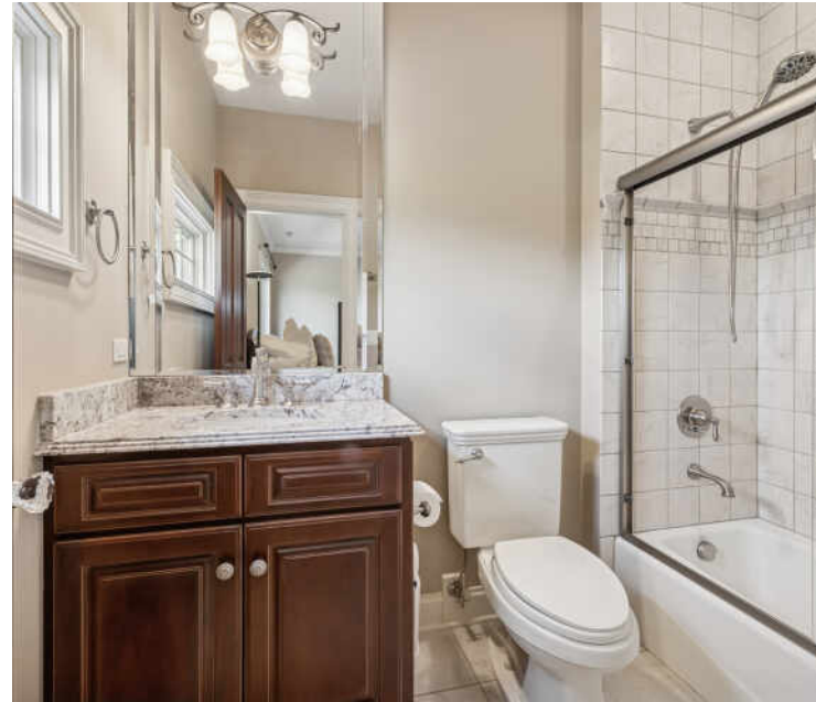
2ND BEDROOM ENSUITE BATH