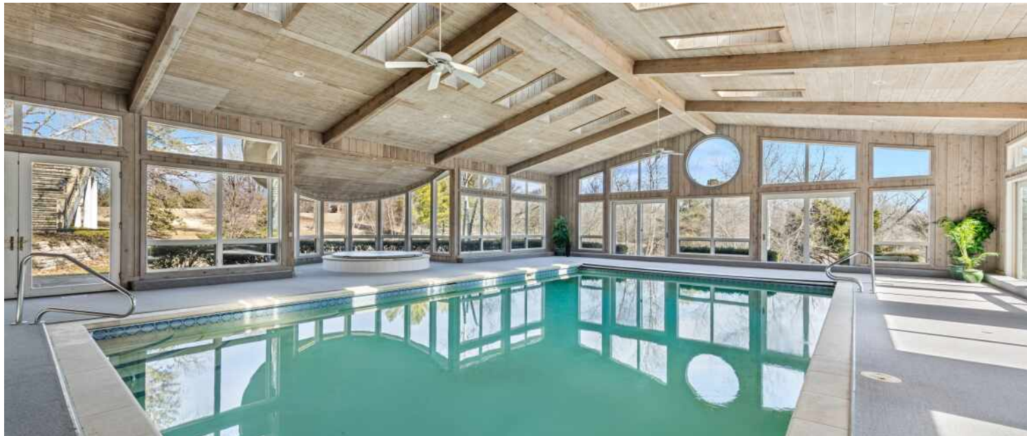
INDOOR POOL / SPA