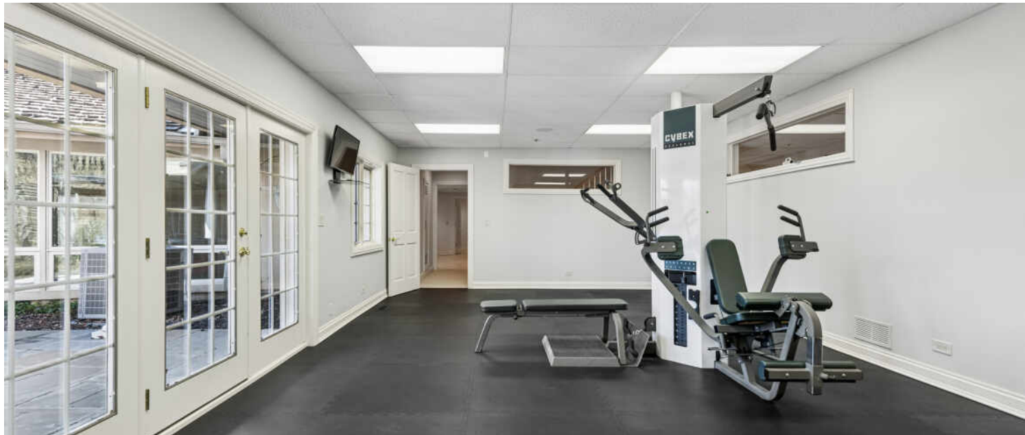
WALK-OUT LOWER LEVEL FITNESS ROOM