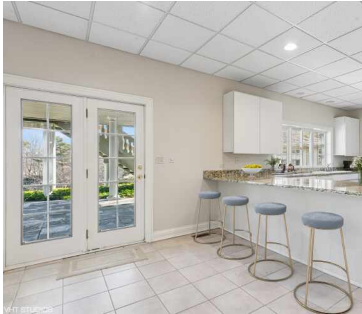
WALK-OUT LOWER LEVEL KITCHEN