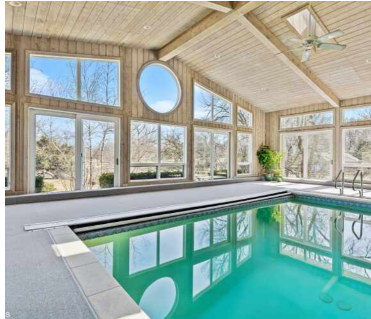
INDOOR POOL / SPA