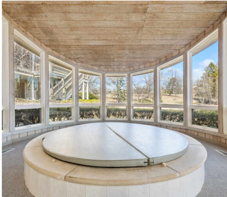
SPA / HOT TUB