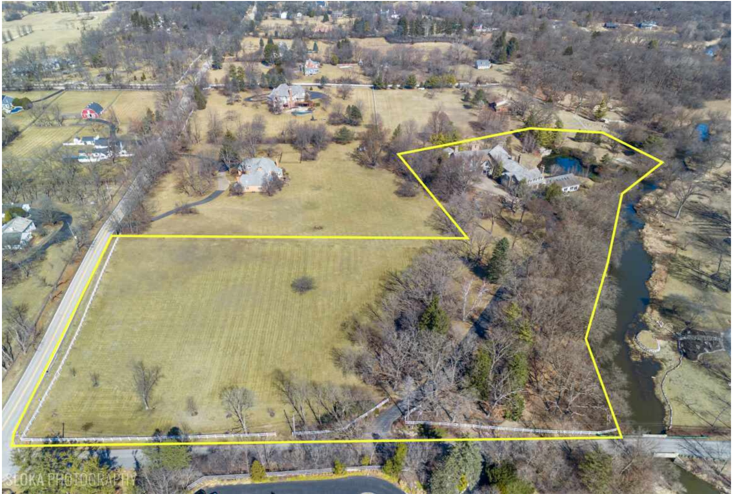
AERIAL VIEW WITH OUTLINE