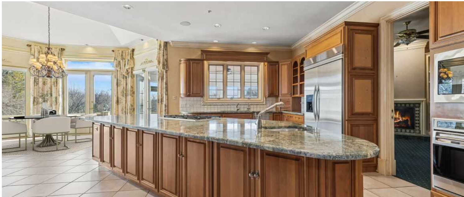
KITCHEN / BREAKFAST ROOM