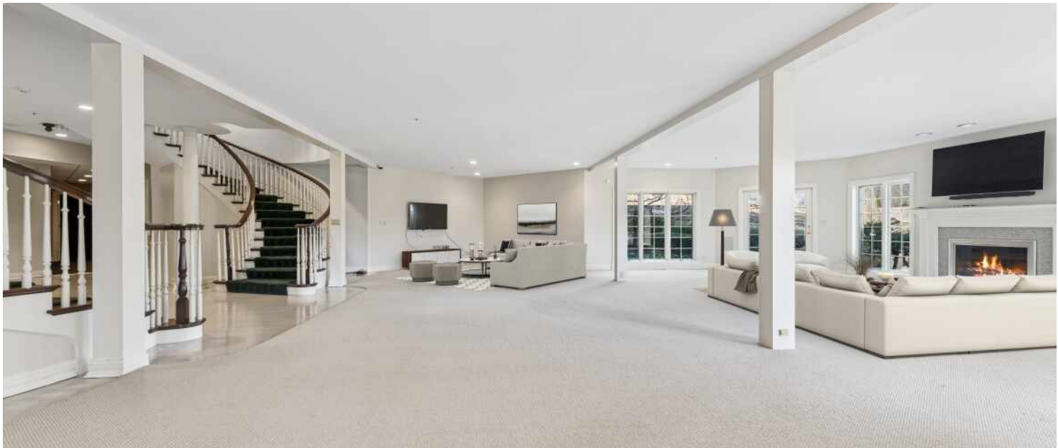
WALK-OUT LOWER LEVEL RECREATION ROOM