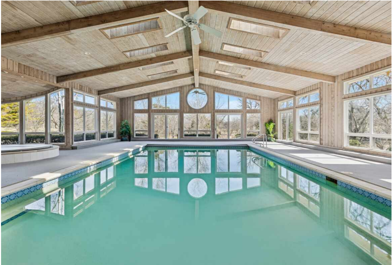
INDOOR POOL / SPA