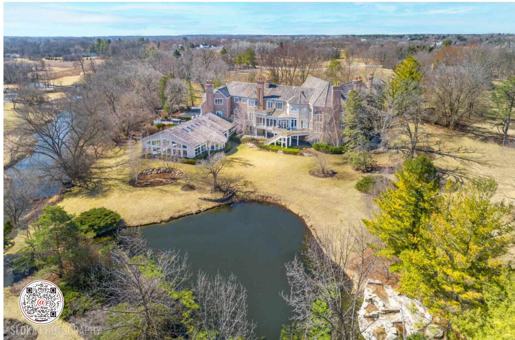
560 OAK KNOLL ROAD BARRINGTON HILLS