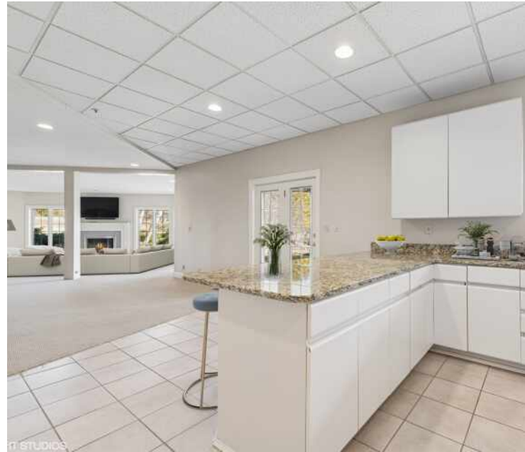
WALK-OUT LOWER LEVEL KITCHEN