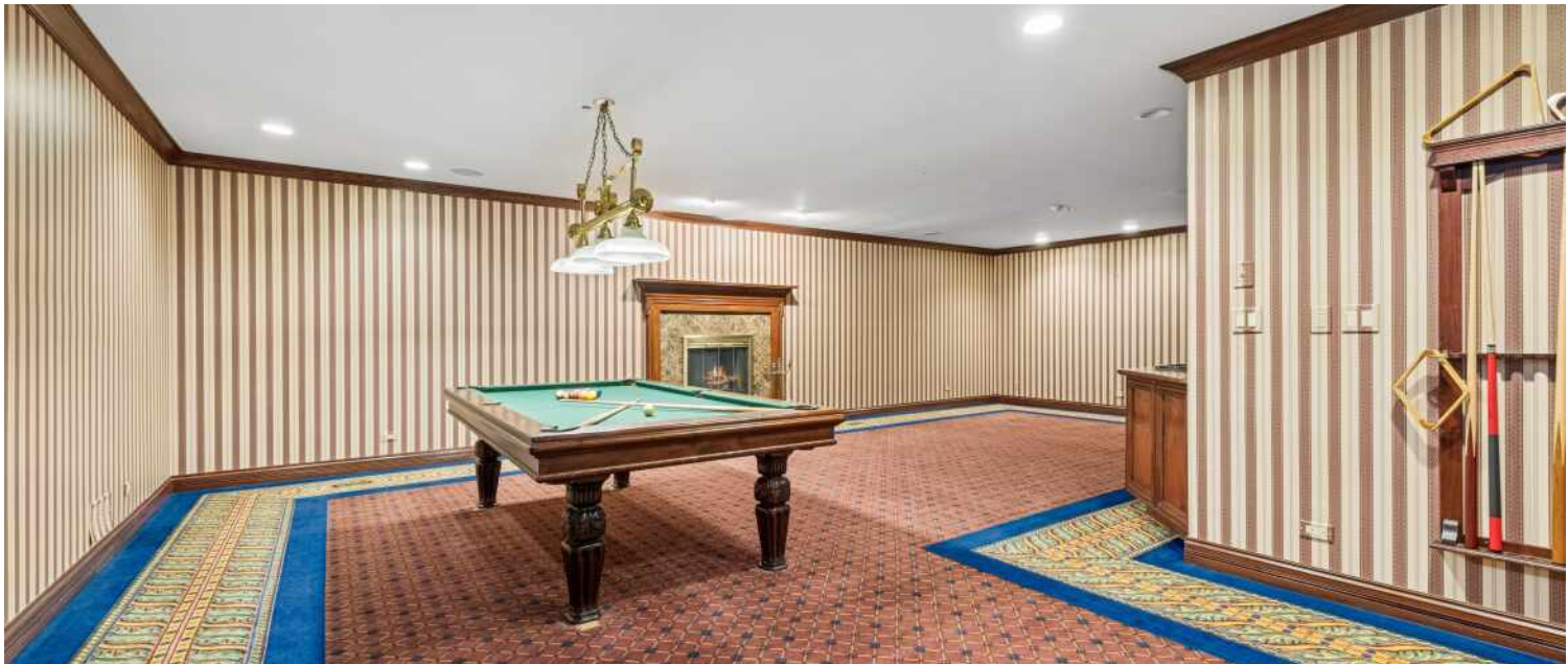
WALK-OUT LOWER LEVEL BILLIARD ROOM