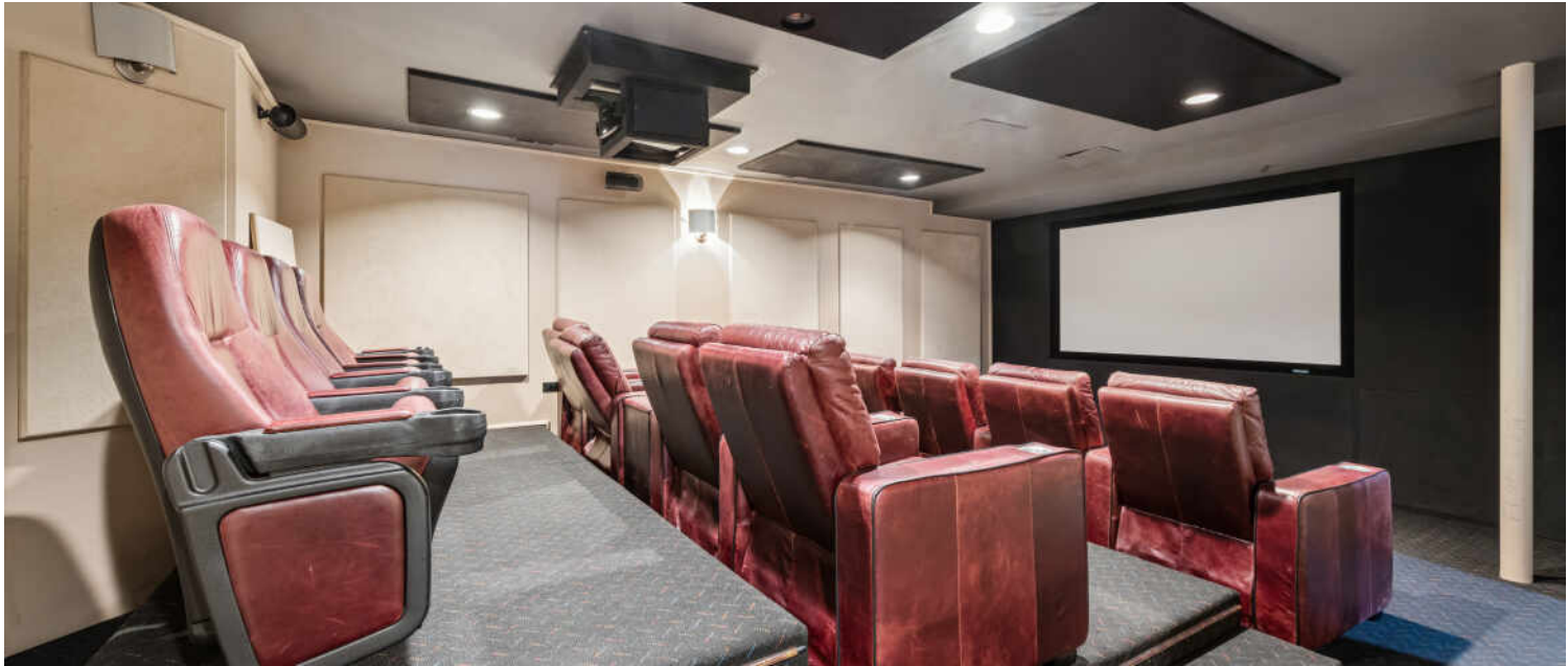
WALK-OUT LOWER LEVEL THEATER ROOM