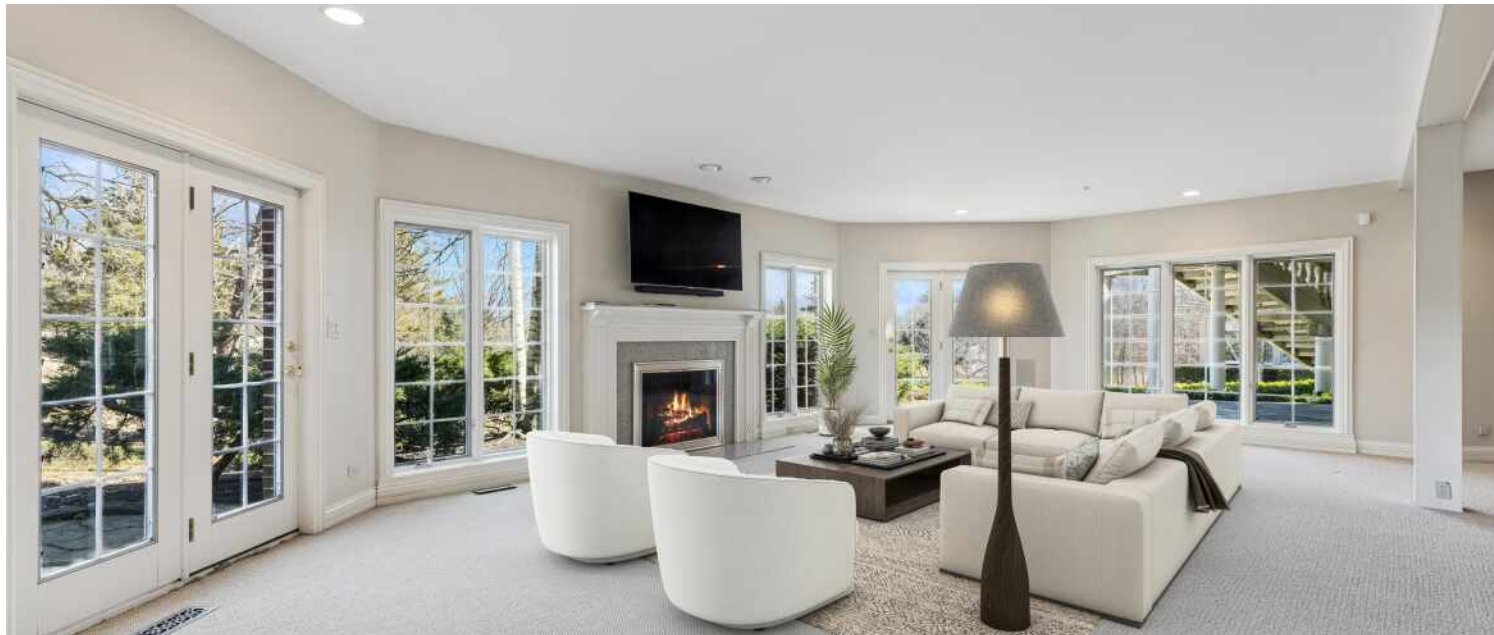
WALK-OUT LOWER LEVEL RECREATION ROOM