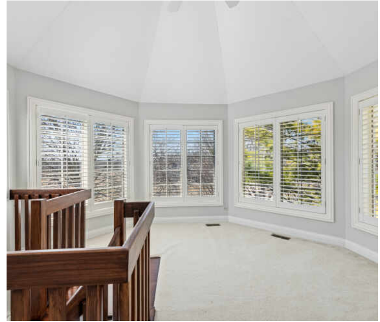
BEDROOM 3 LOFT