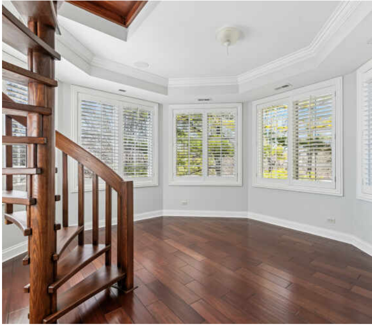
BEDROOM 3 SITTING AREA