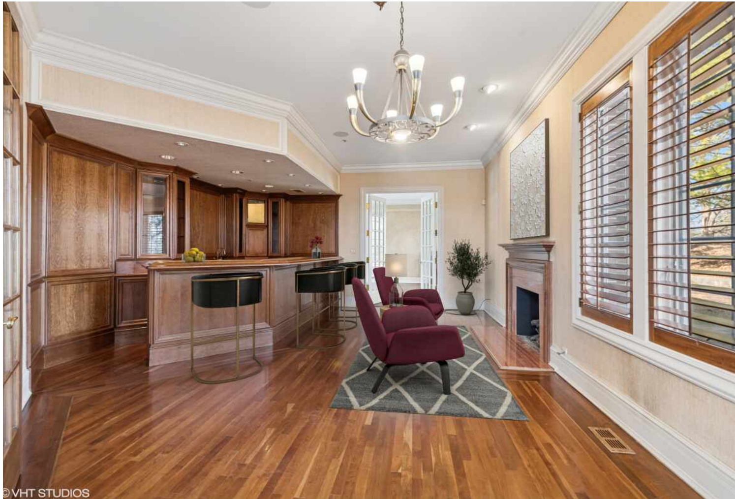
WET BAR / SITTING AREA