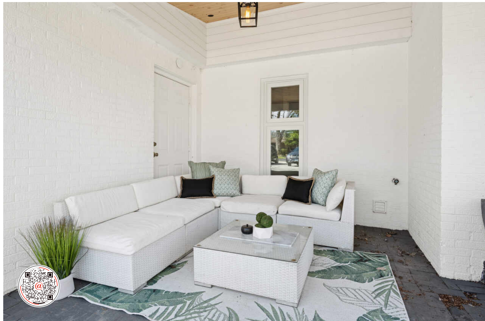
570 HAPP ROAD NORTHFIELD