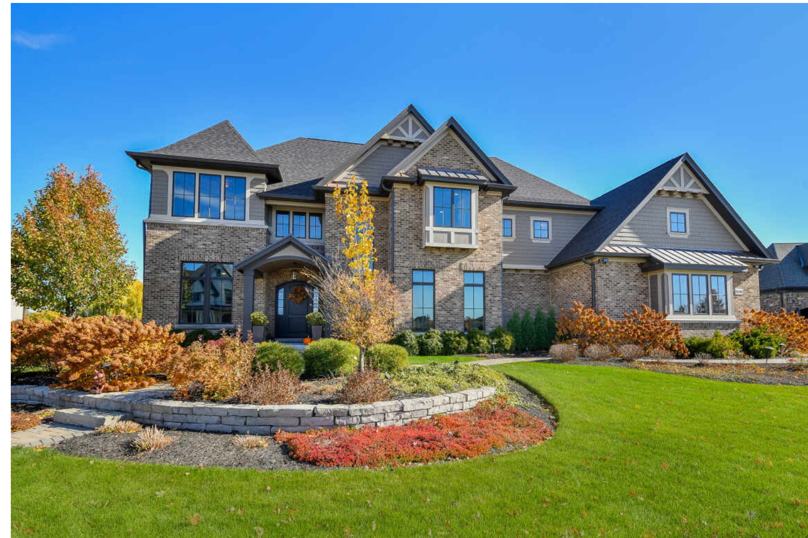
5N193 PRAIRIE ROSE DRIVE • CAMPTON HILLS

@properties | CHRISTIE'S INTERNATIONAL REAL ESTATE