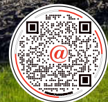
5N193 PRAIRIE ROSE DRIVE CAMPTON HILLS