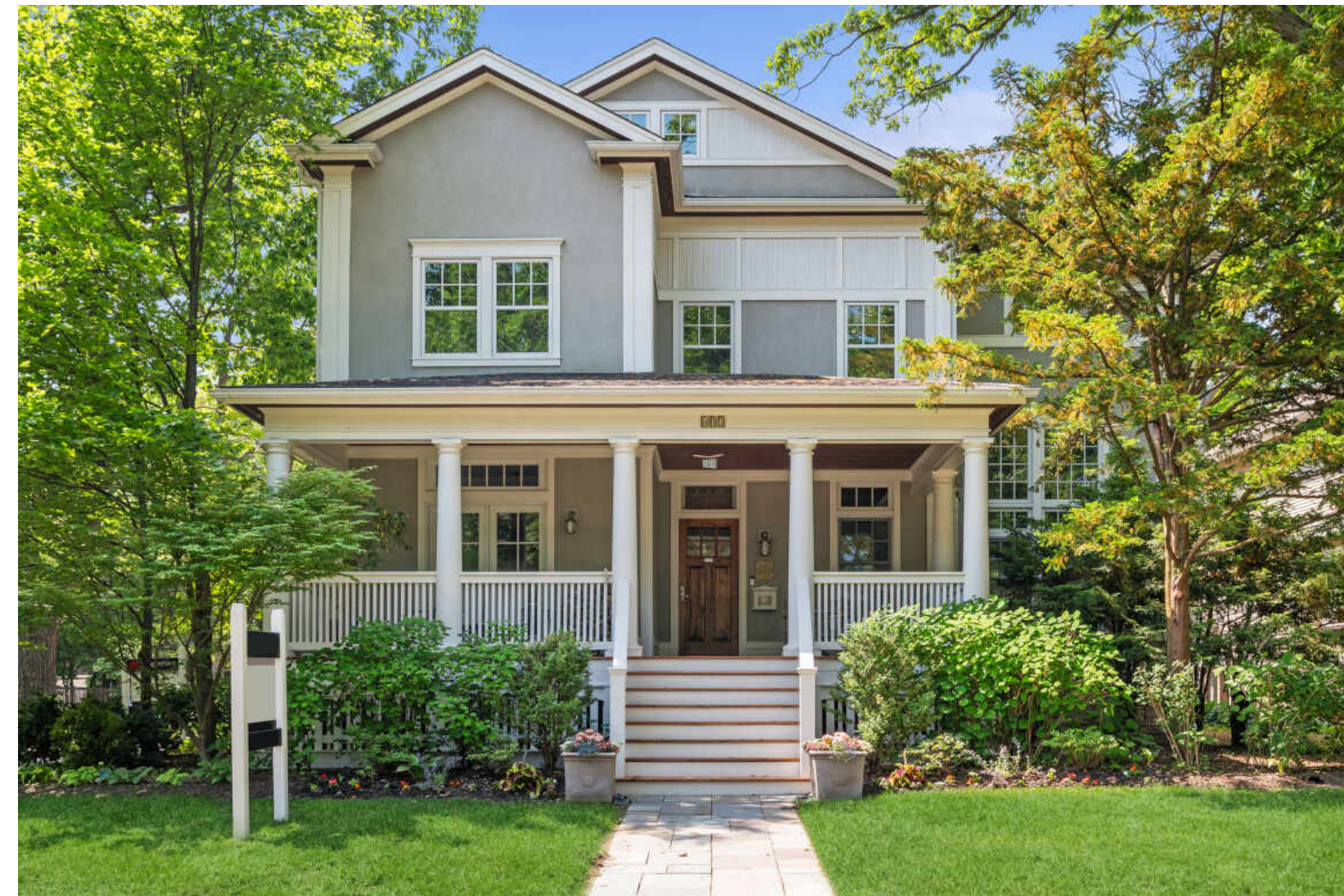
603 CENTRAL AVENUE • WILMETTE 603CENTRAL.INFO

@properties | CHRISTIE'S INTERNATIONAL REAL ESTATE