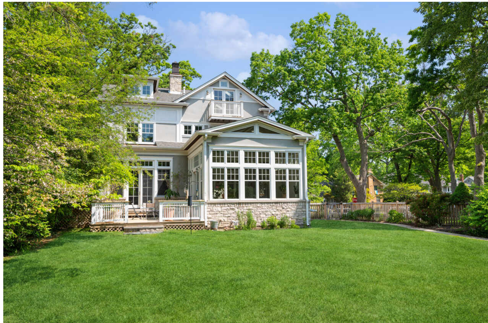
603 CENTRAL AVENUE WILMETTE