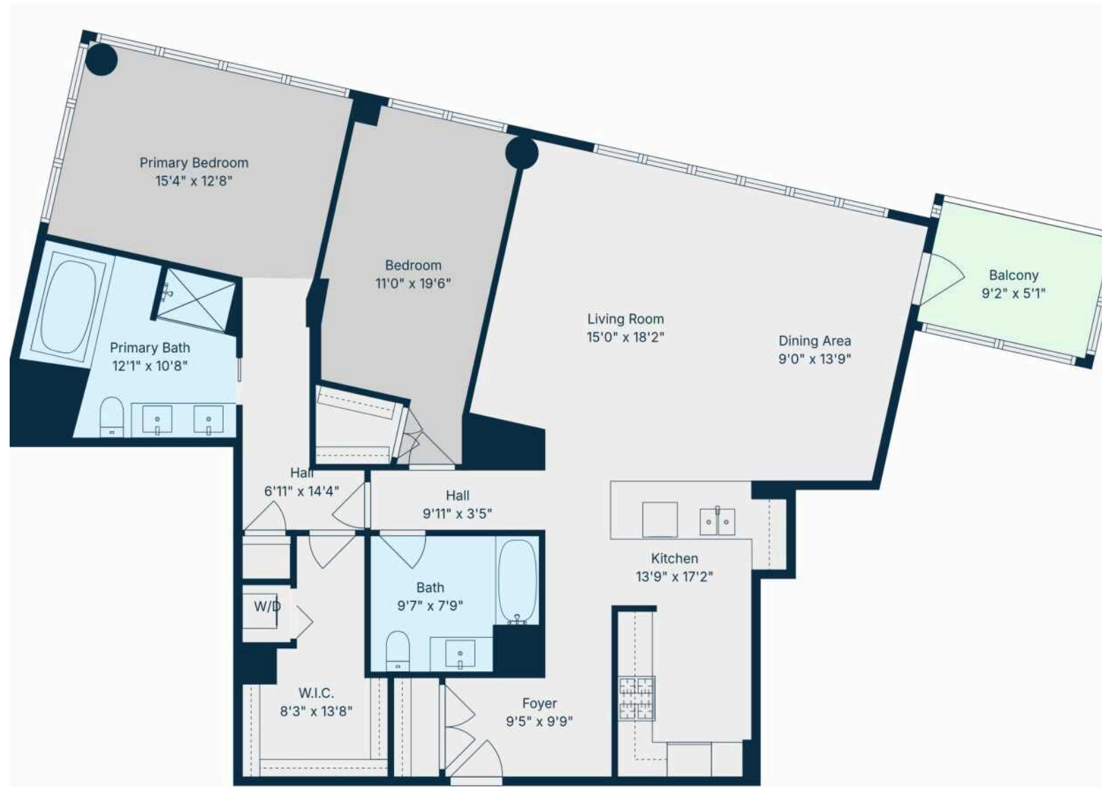
Floor Plan Created By Cubicasa App. Measurements Deemed Highly Reliable But Not Guaranteed.