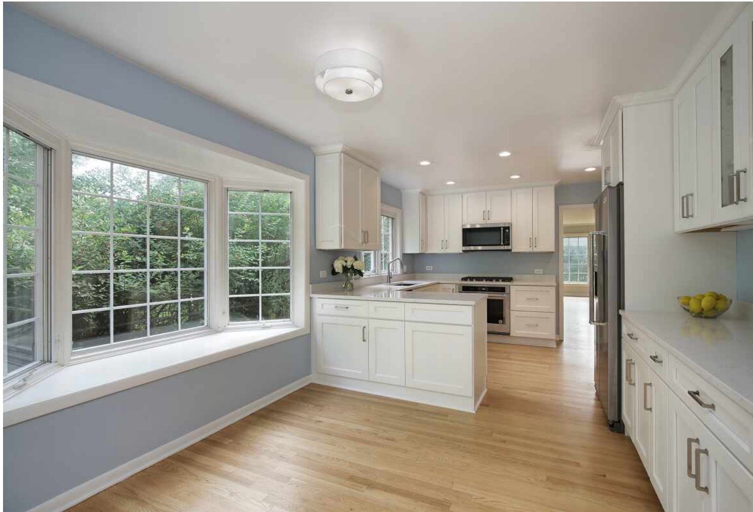
KITCHEN/EAT-IN KITCHEN AREA