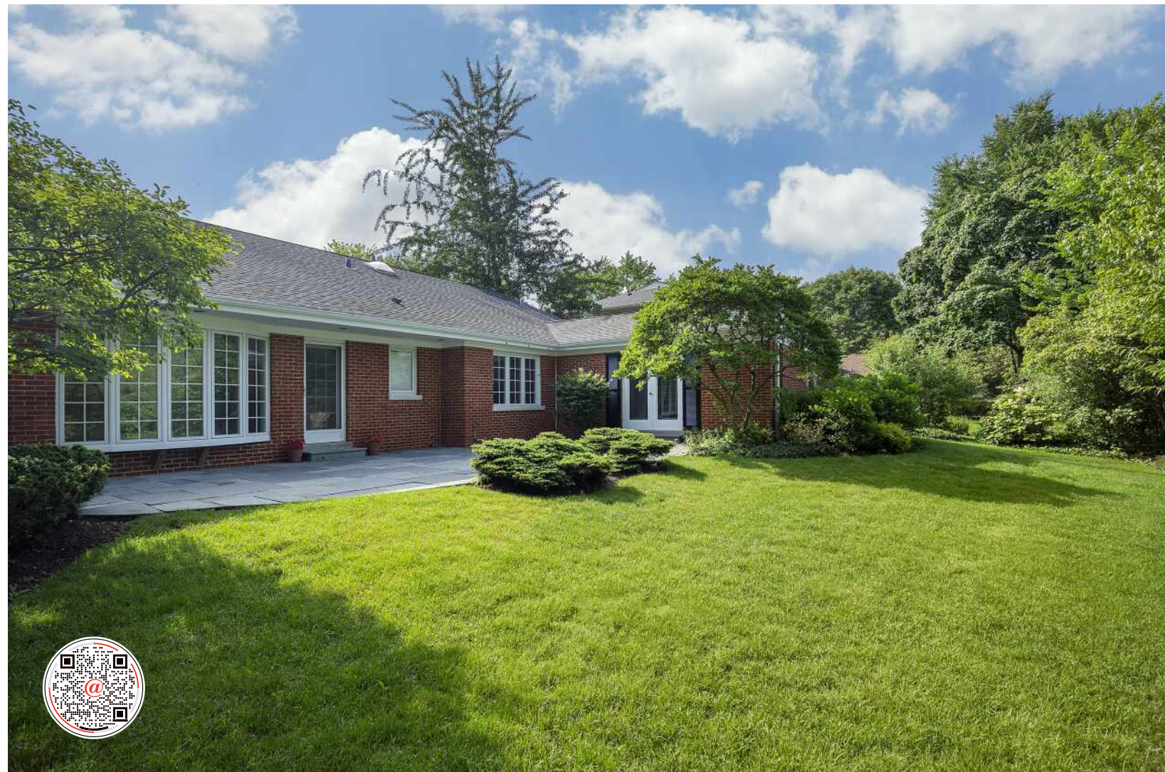
612 HILL CIRCLE · GLENVIEW