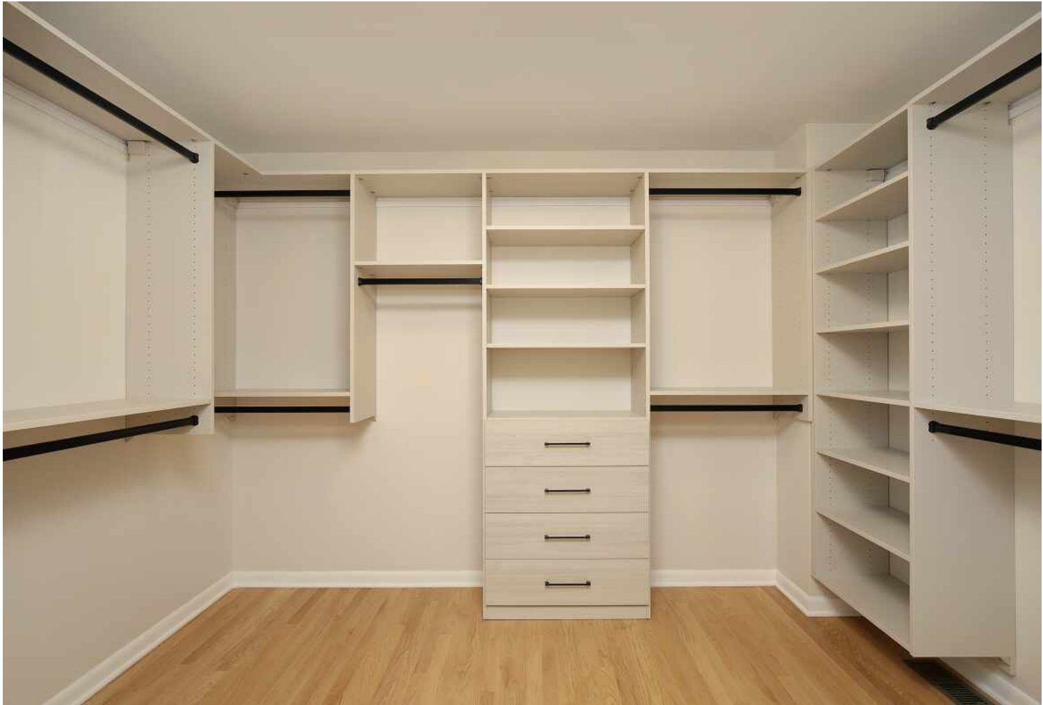
PRIMARY WALK IN CLOSET