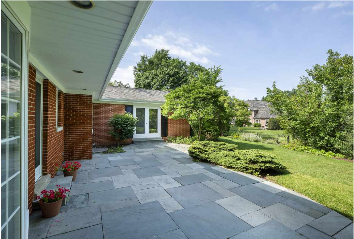
BACK OF HOUSE - BLUESTONE PATIO