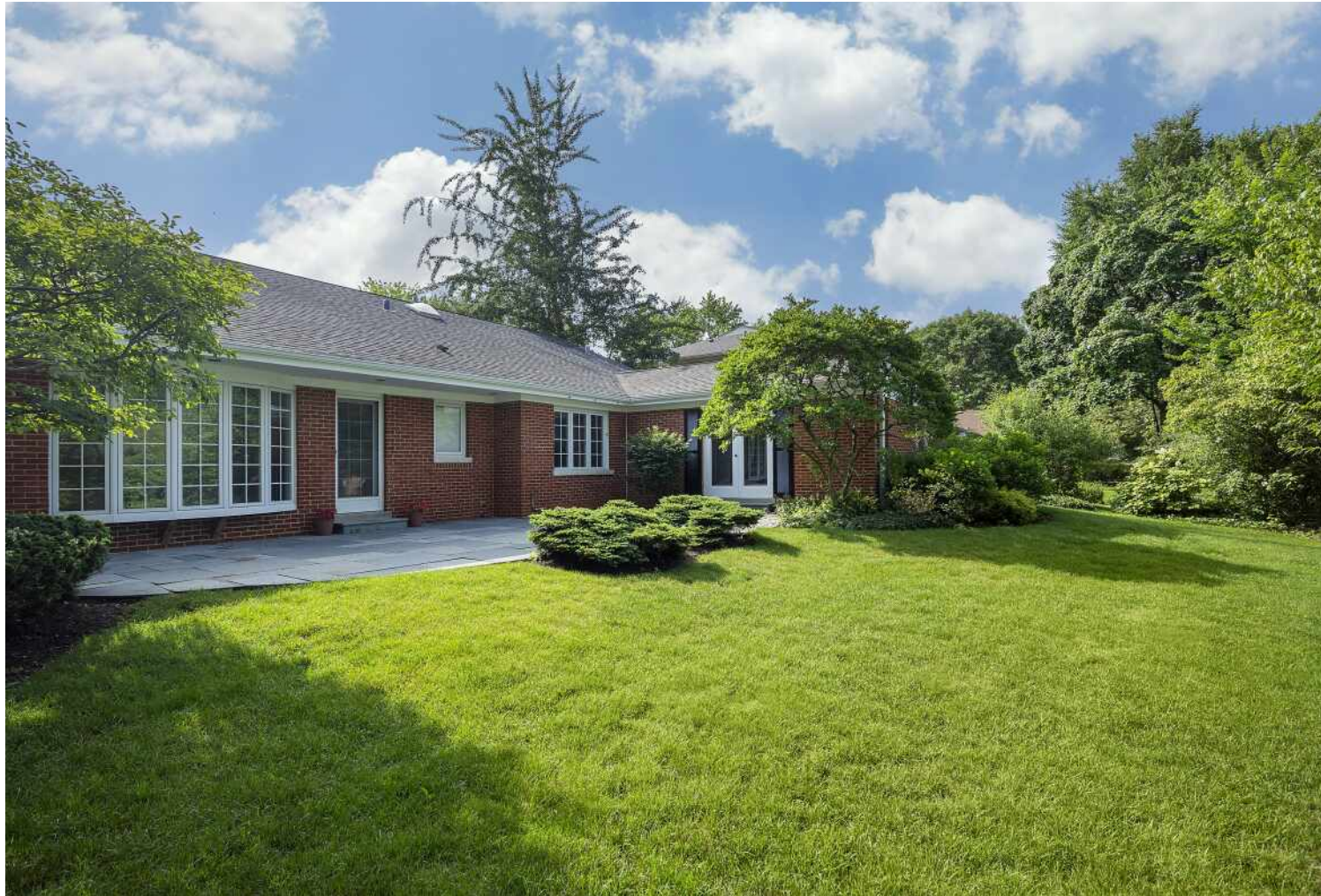
BACK OF HOUSE