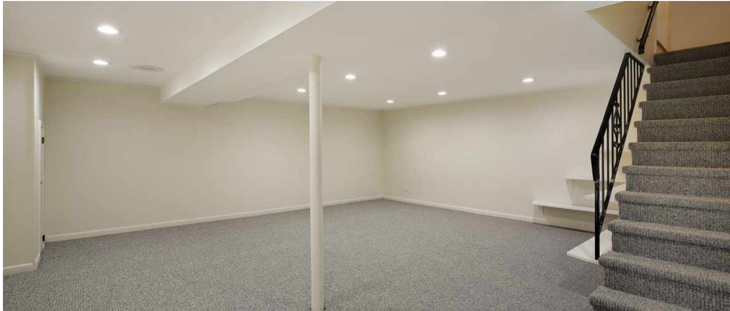
FINISHED BASEMENT ROOM ONE