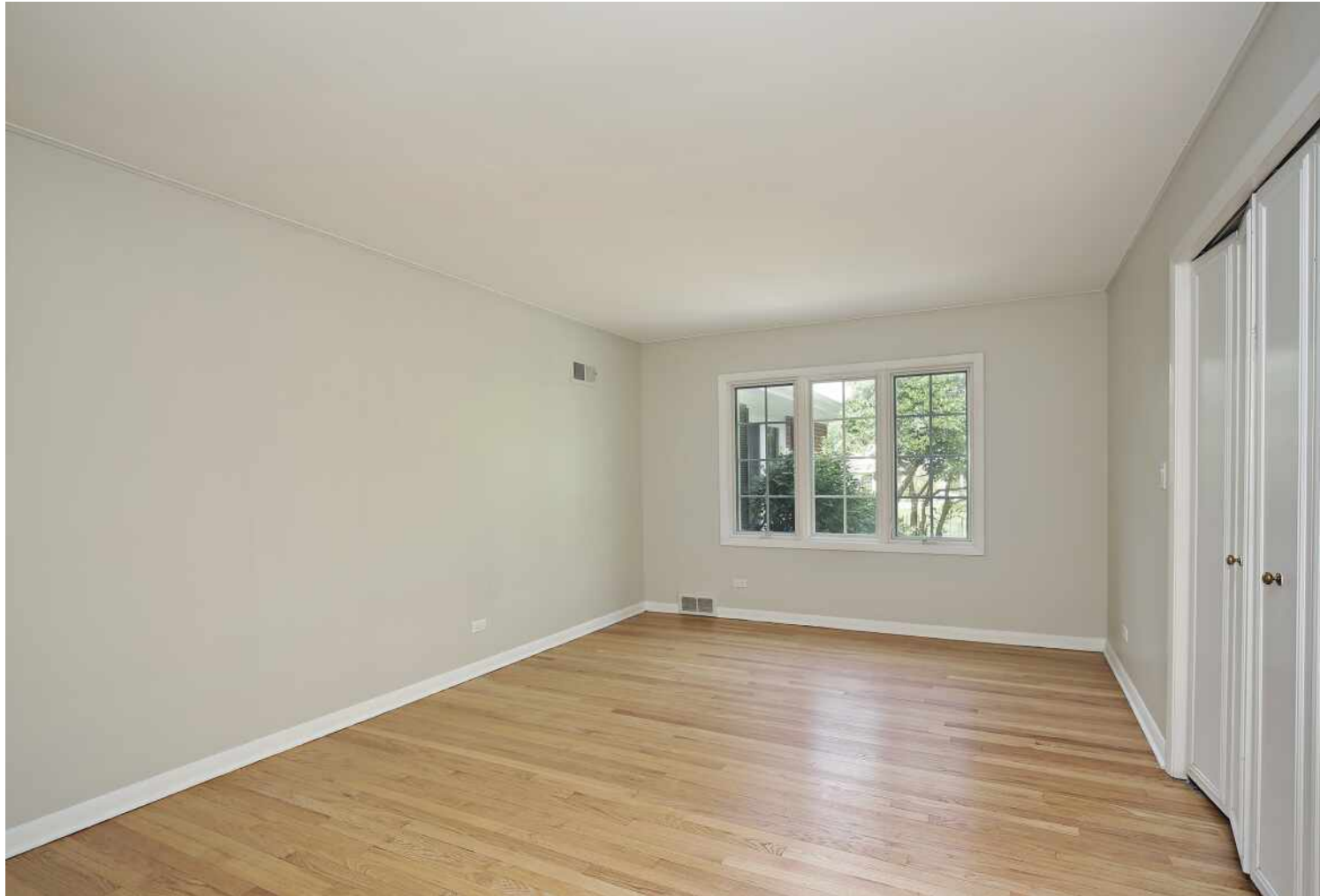
BEDROOM TWO - FIRST FLOOR