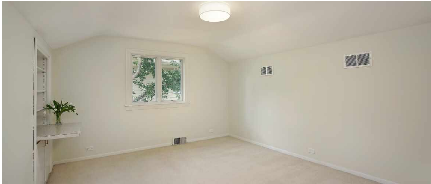
BEDROOM THREE - SECOND FLOOR