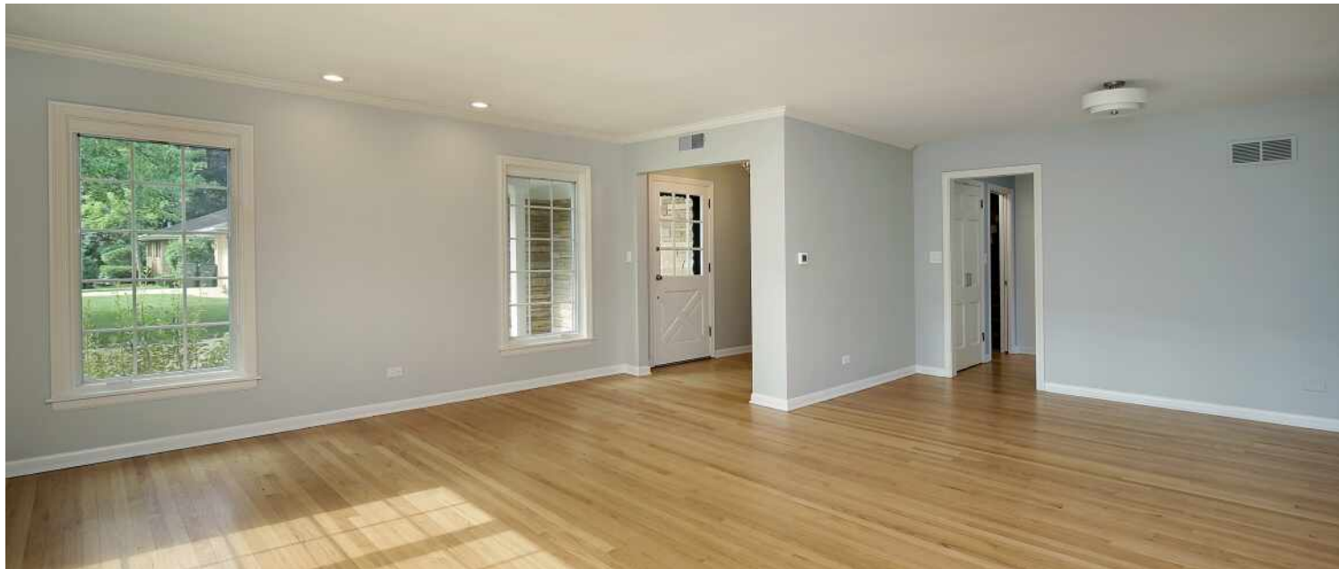
LIVING ROOM INTO KITCHEN