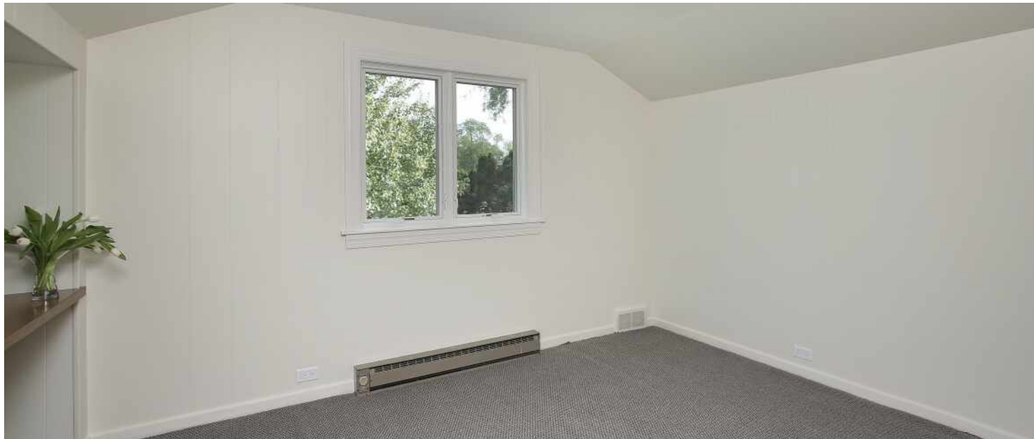
BEDROOM FOUR - SECOND FLOOR