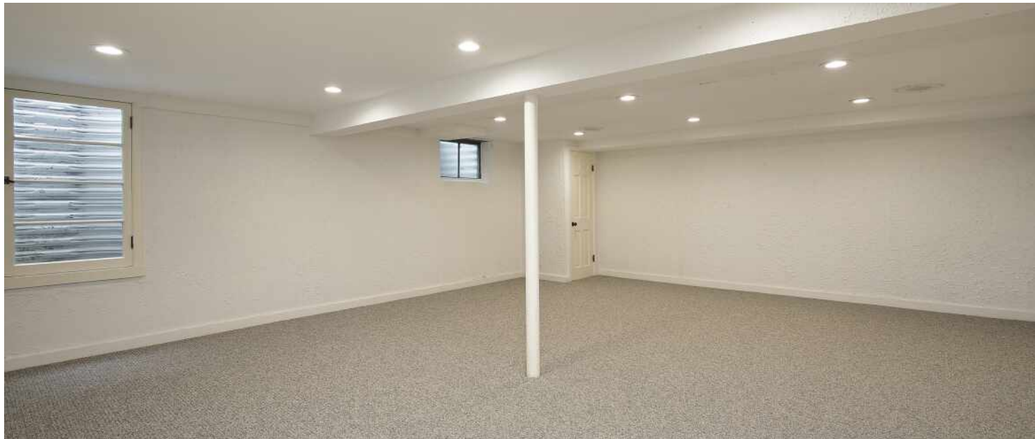
FINISHED BASEMENT ROOM TWO