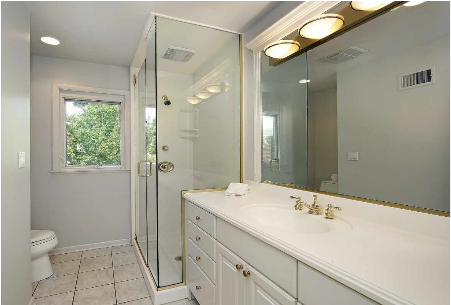
GUEST BATH FIRST FLOOR