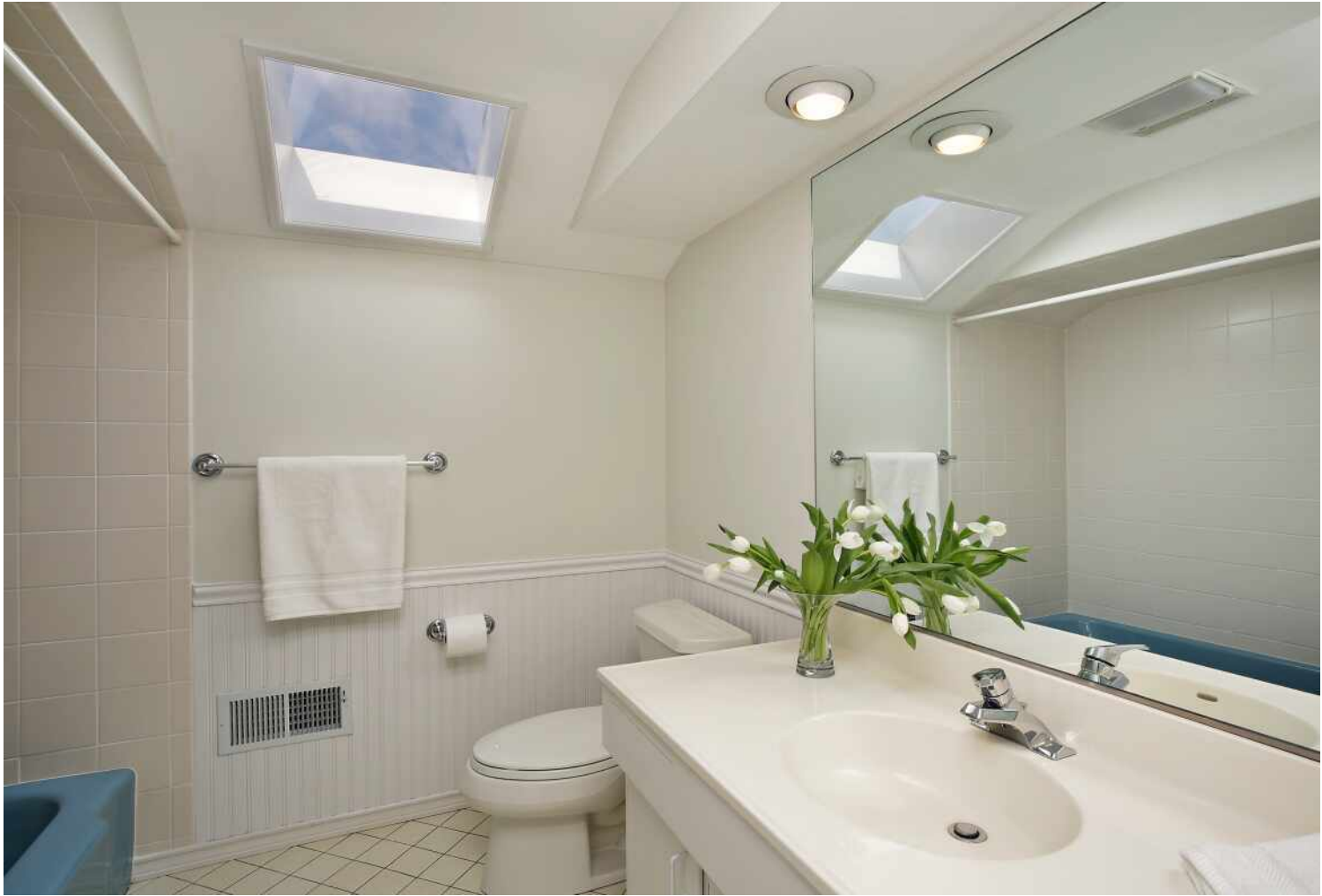
HALL BATH SECOND FLOOR