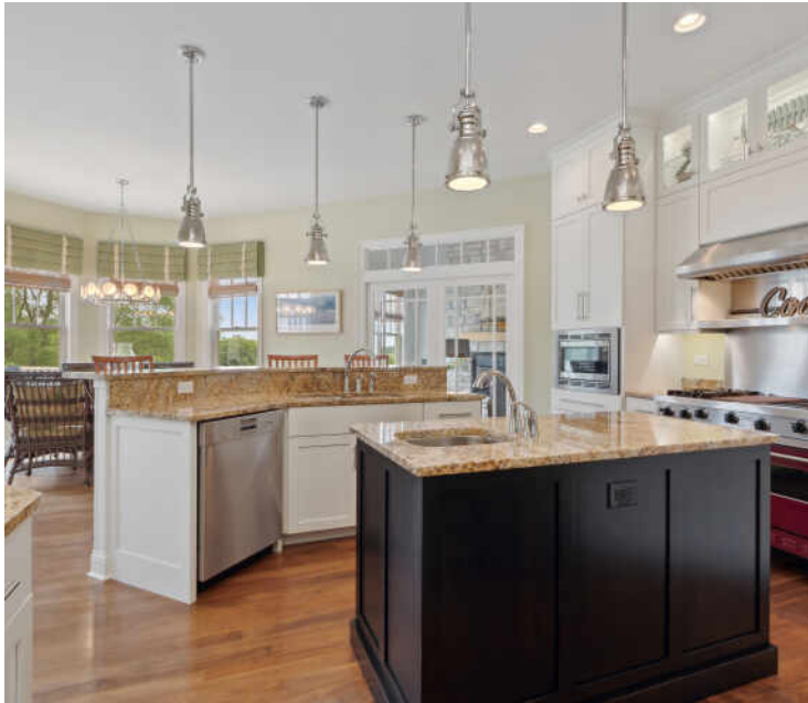
KITCHEN / BREAKFAST ROOM