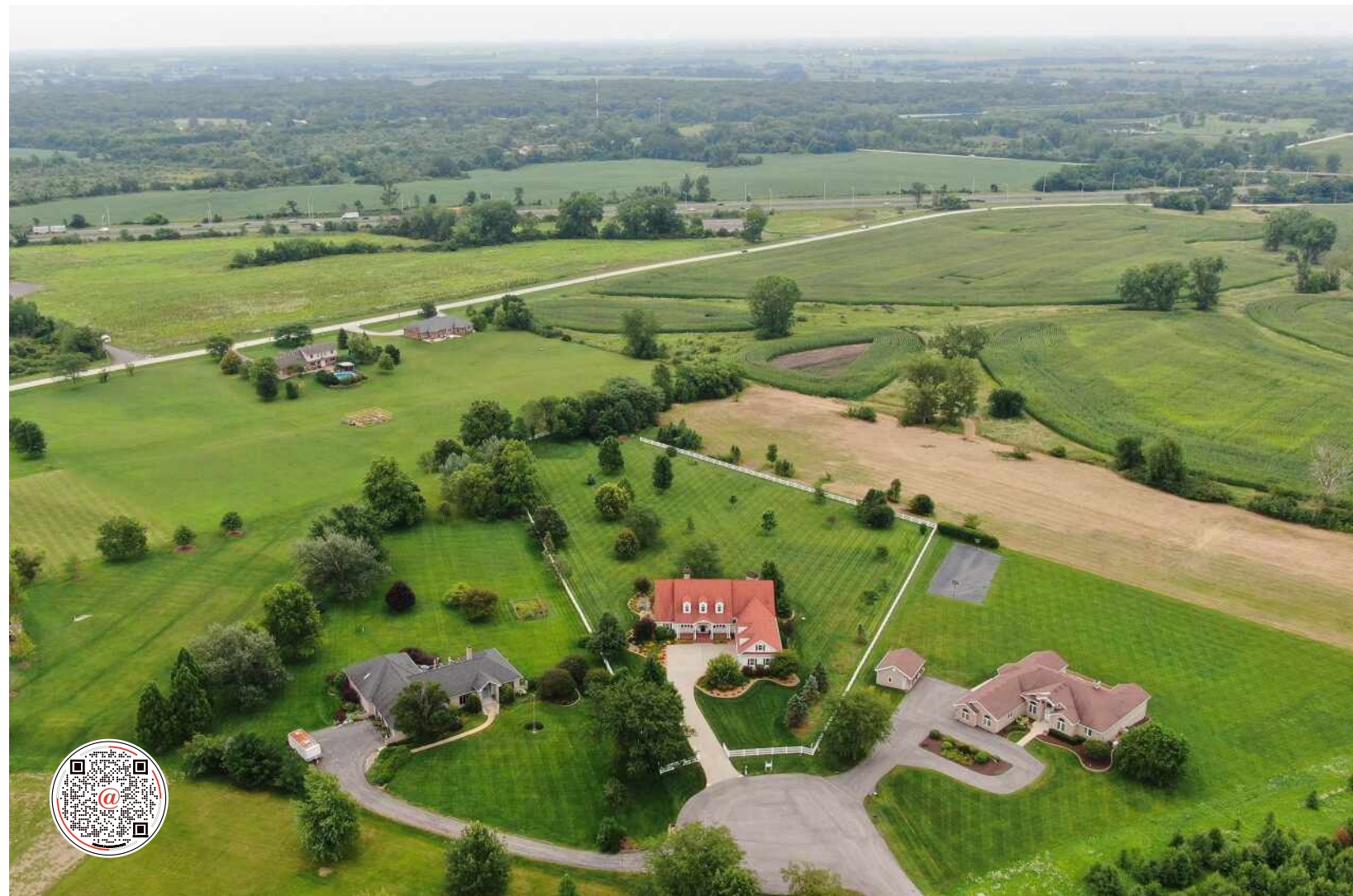
6531 W CEDAR COURT MONEE