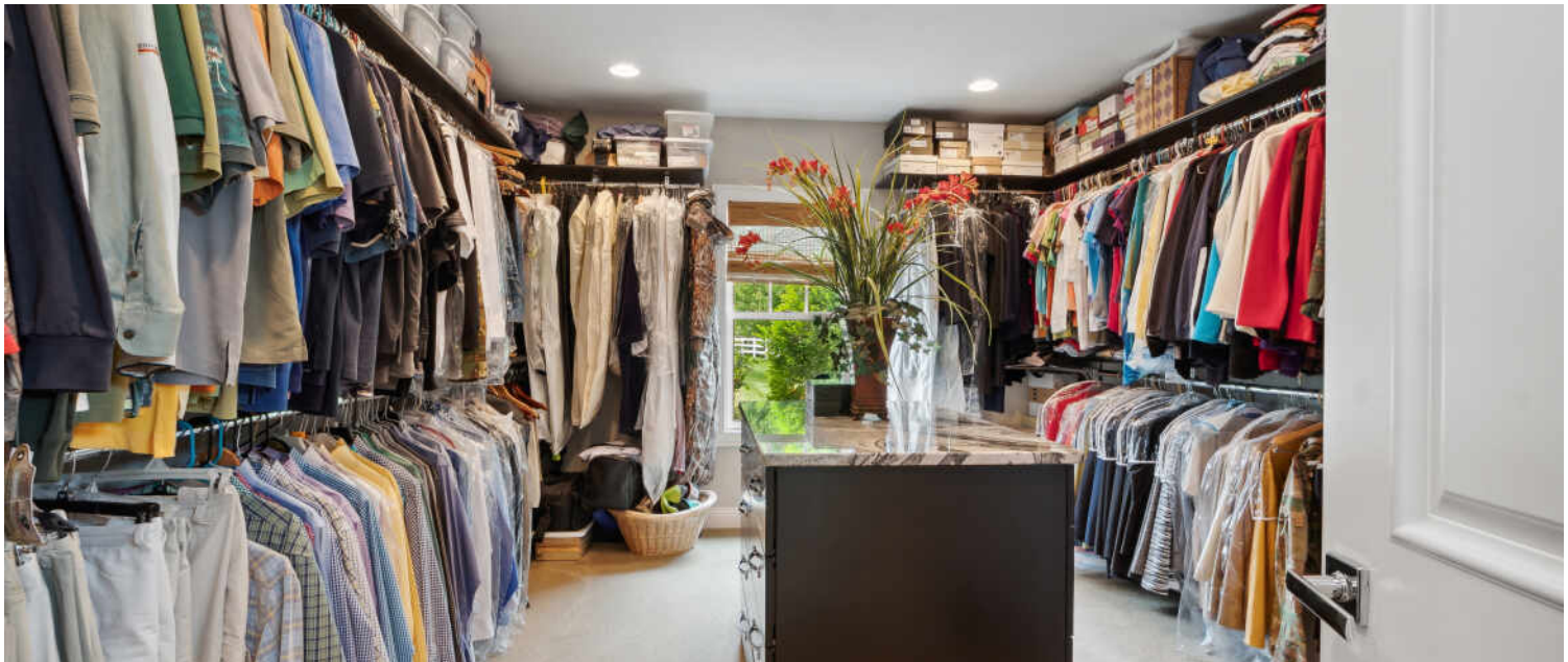
PRIMARY BEDROOM CLOSET