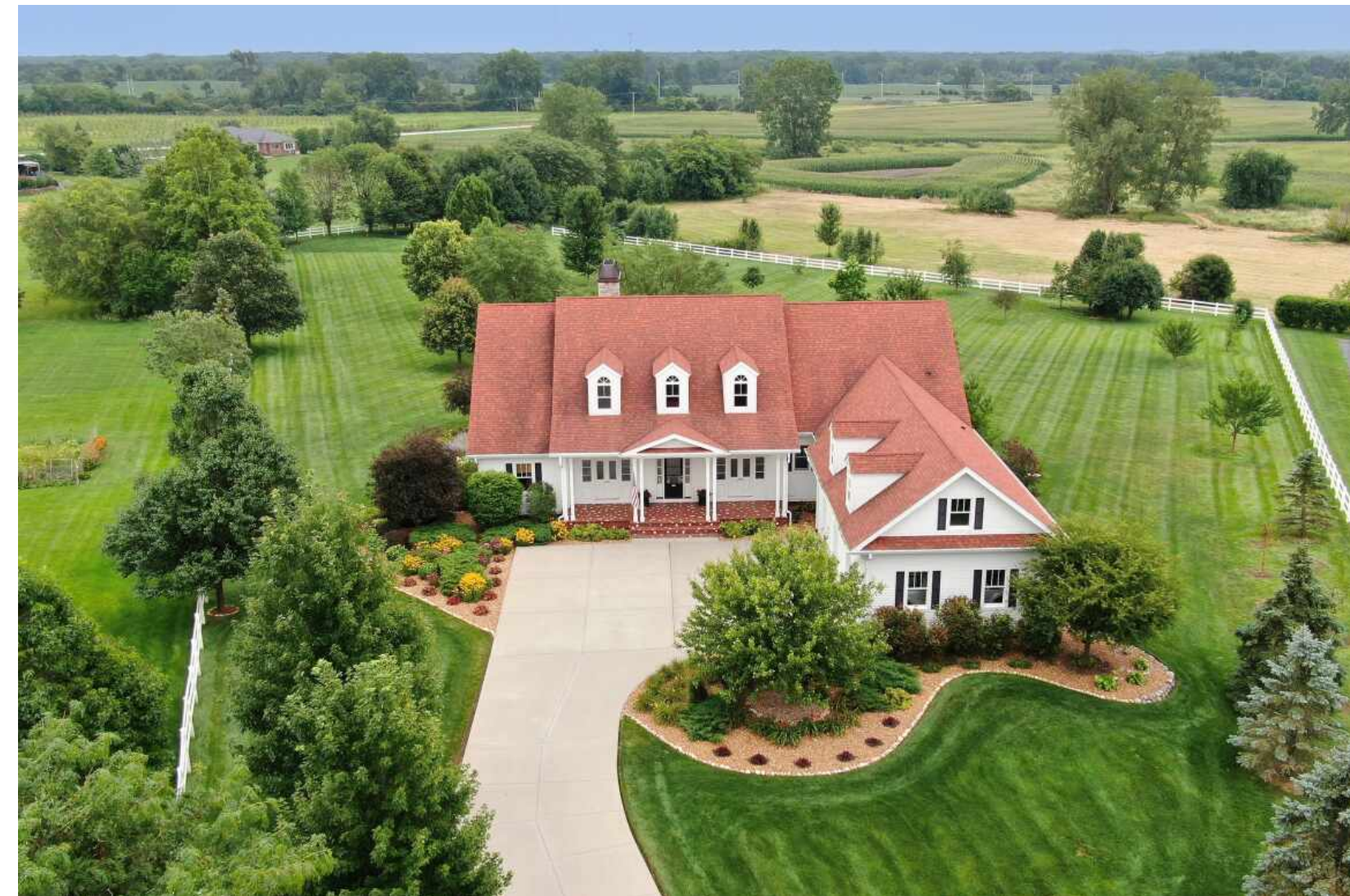
6531 W CEDAR COURT · MONEE

@properties | CHRISTIE'S INTERNATIONAL REAL ESTATE