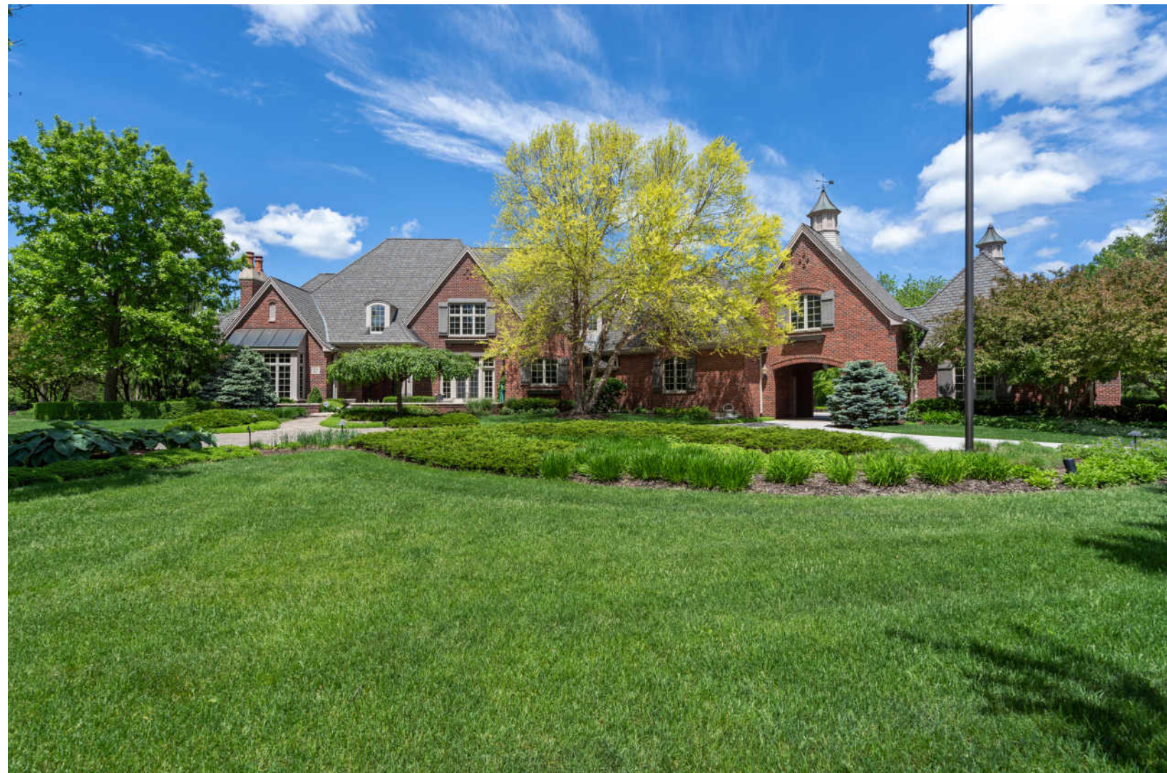
65 STIRRUP CUP COURT ST CHARLES