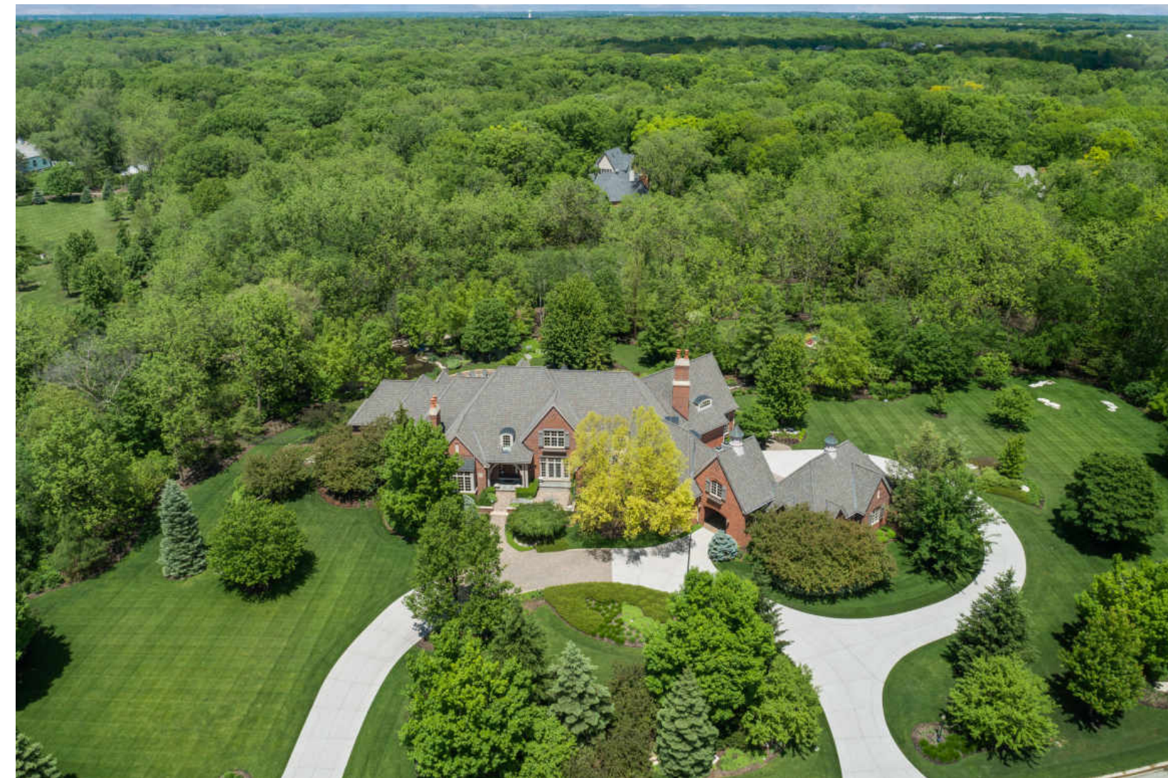
65 STIRRUP CUP COURT ST CHARLES