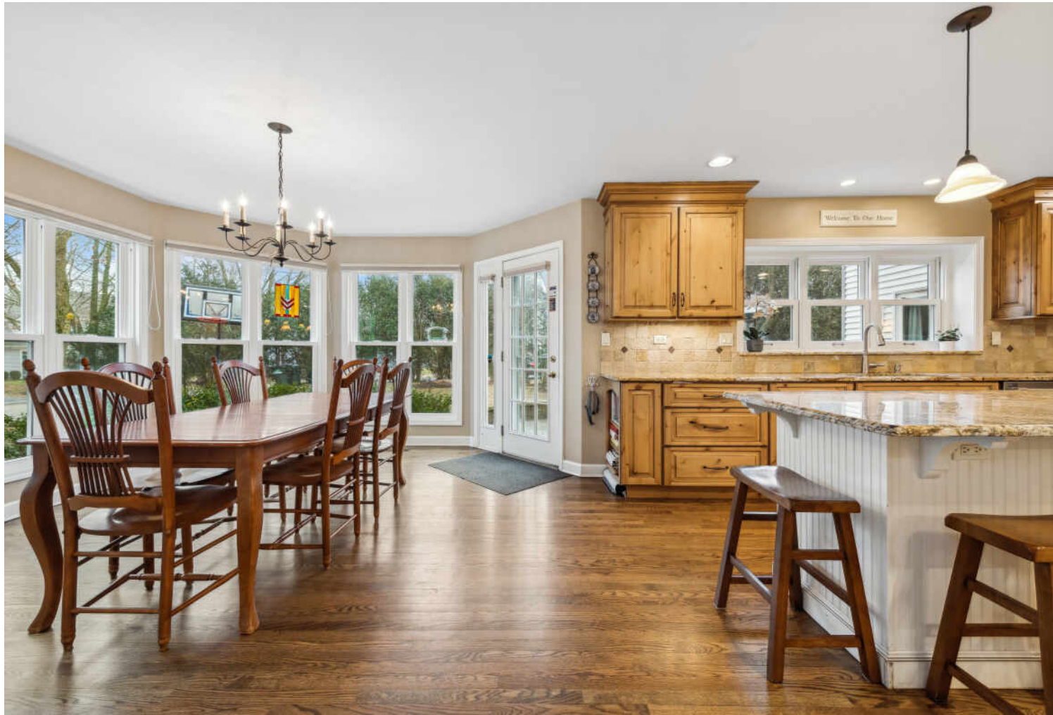
KITCHEN / BREAKFAST ROOM