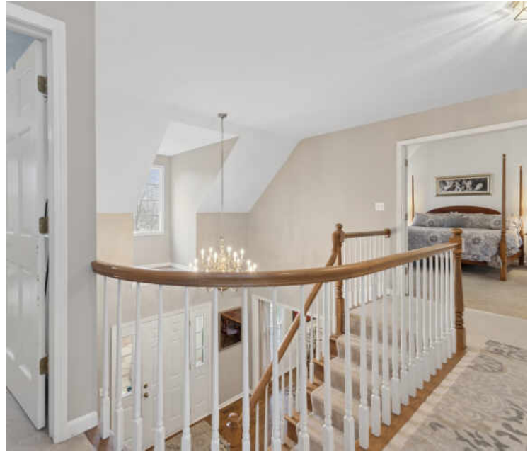
2ND FLOOR HALL