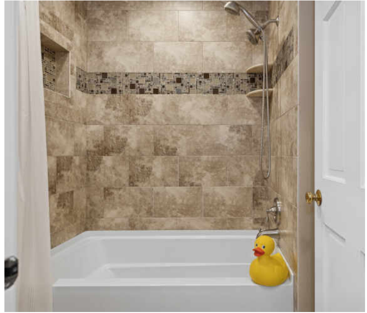
2ND FLOOR HALL BATH