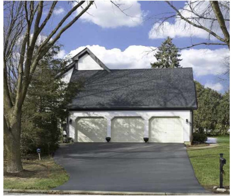
THREE CAR SIDE LOAD GARAGE