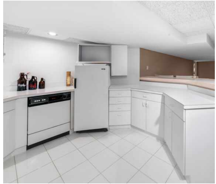
LOWER LEVEL 2ND KITCHEN