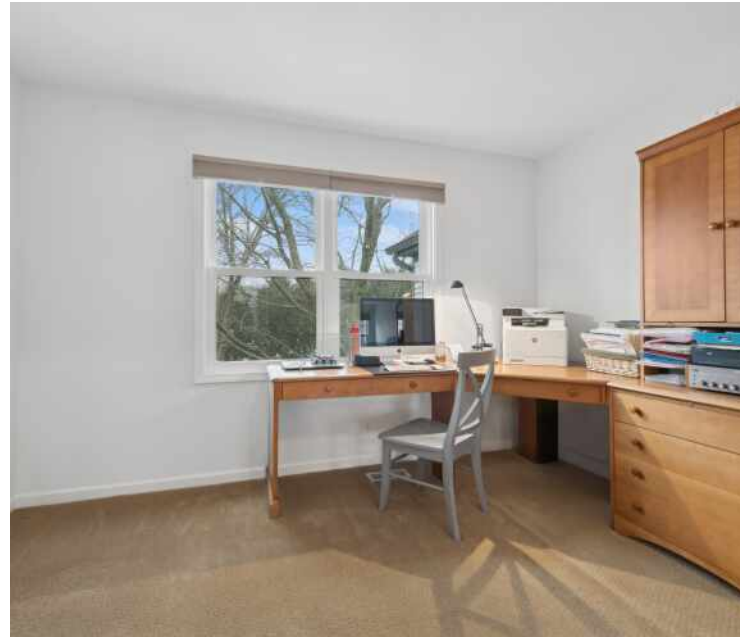
PRIMARY BEDROOM SITTING AREA / OFFICE