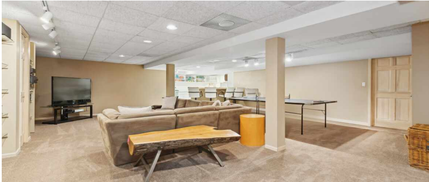
RECREATION / GAME ROOM