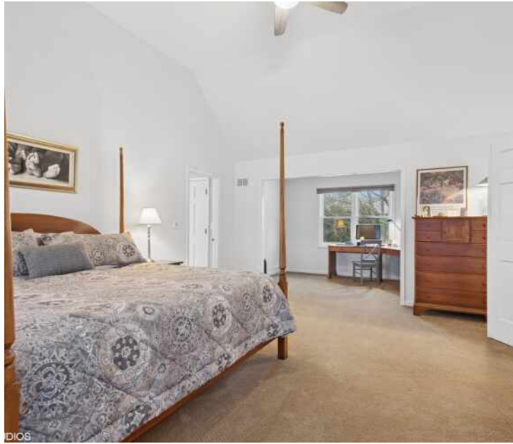
DIOS PRIMARY BEDROOM