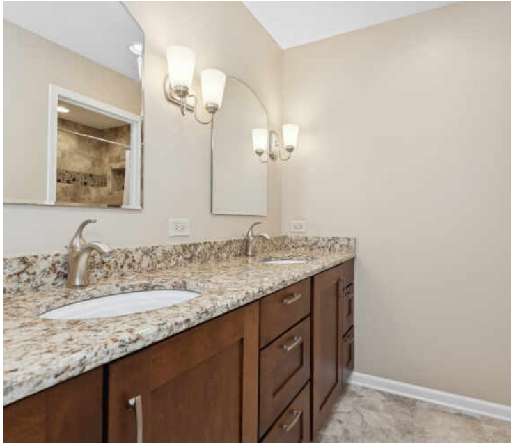
2ND FLOOR HALL BATH