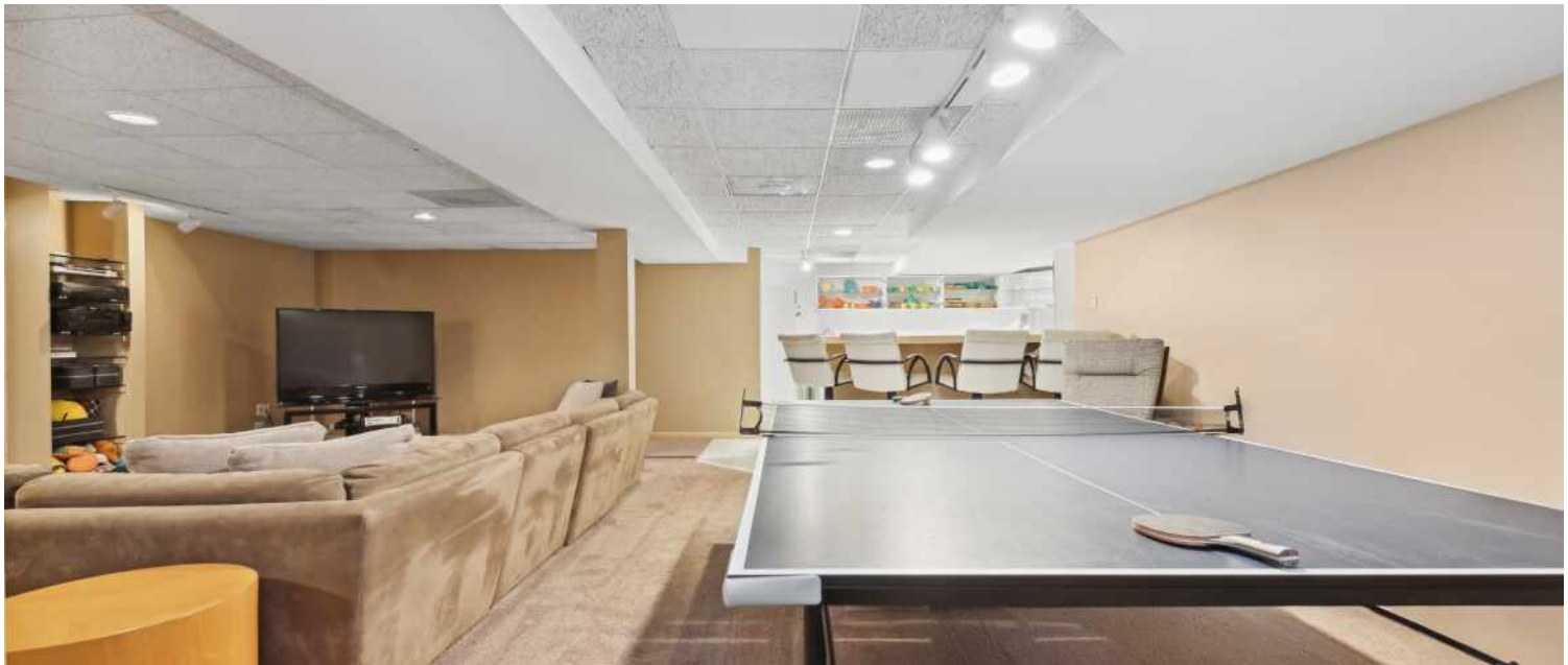
RECREATION / GAME ROOM