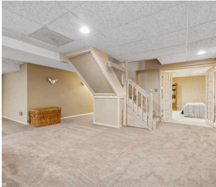
RECREATION ROOM / 5TH BEDROOM