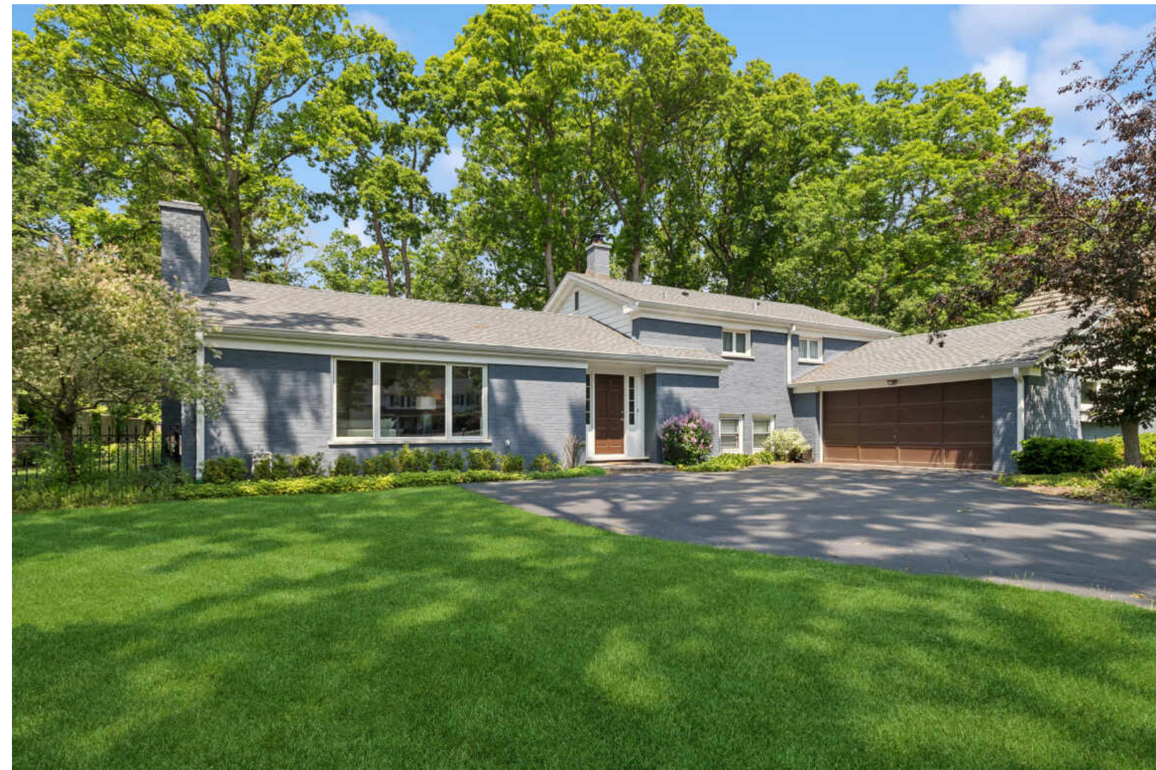
674 TIMBER LANE • LAKE FOREST