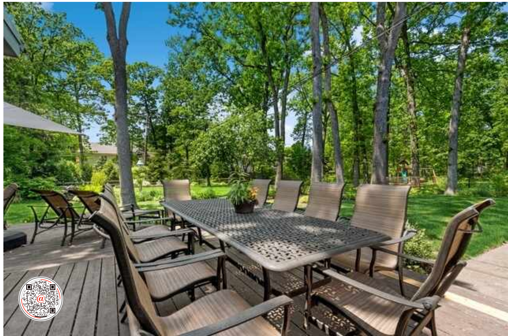
674 TIMBER LANE LAKE FOREST