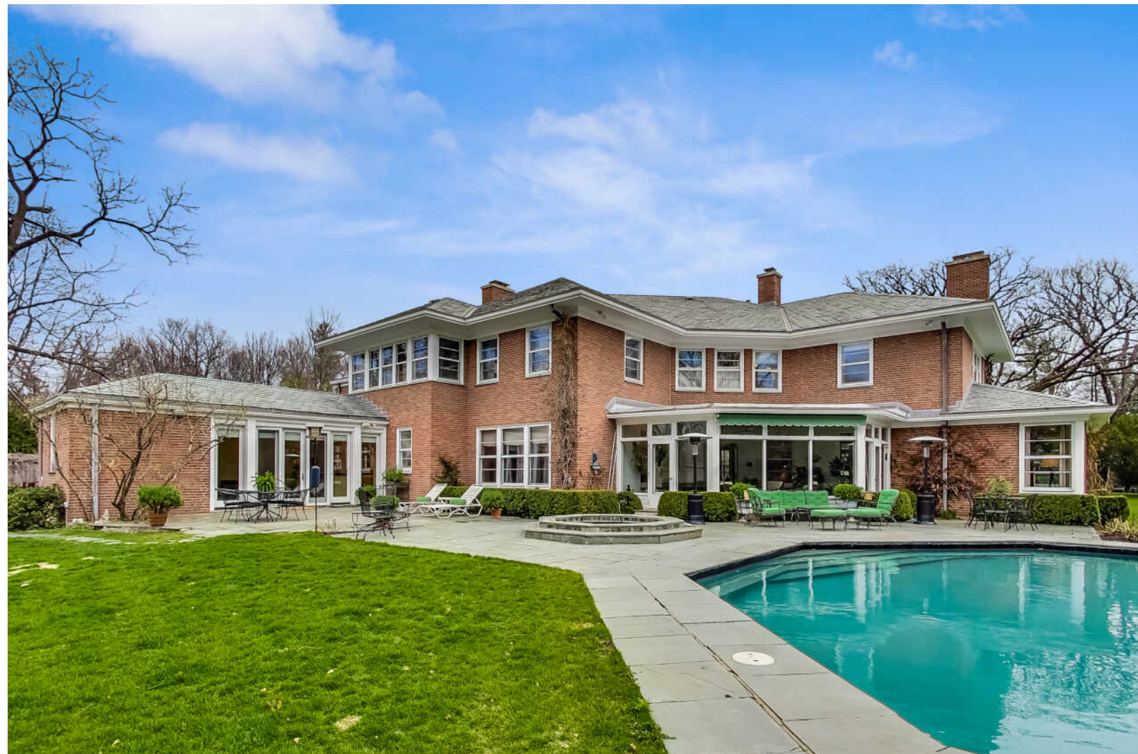
690 N GREEN BAY ROAD LAKE FOREST