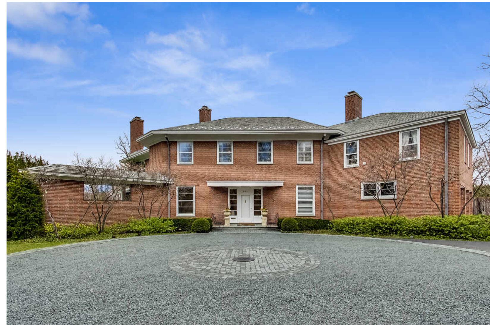
690 N GREEN BAY ROAD • LAKE FOREST 690NGREENBAYROAD.INFO