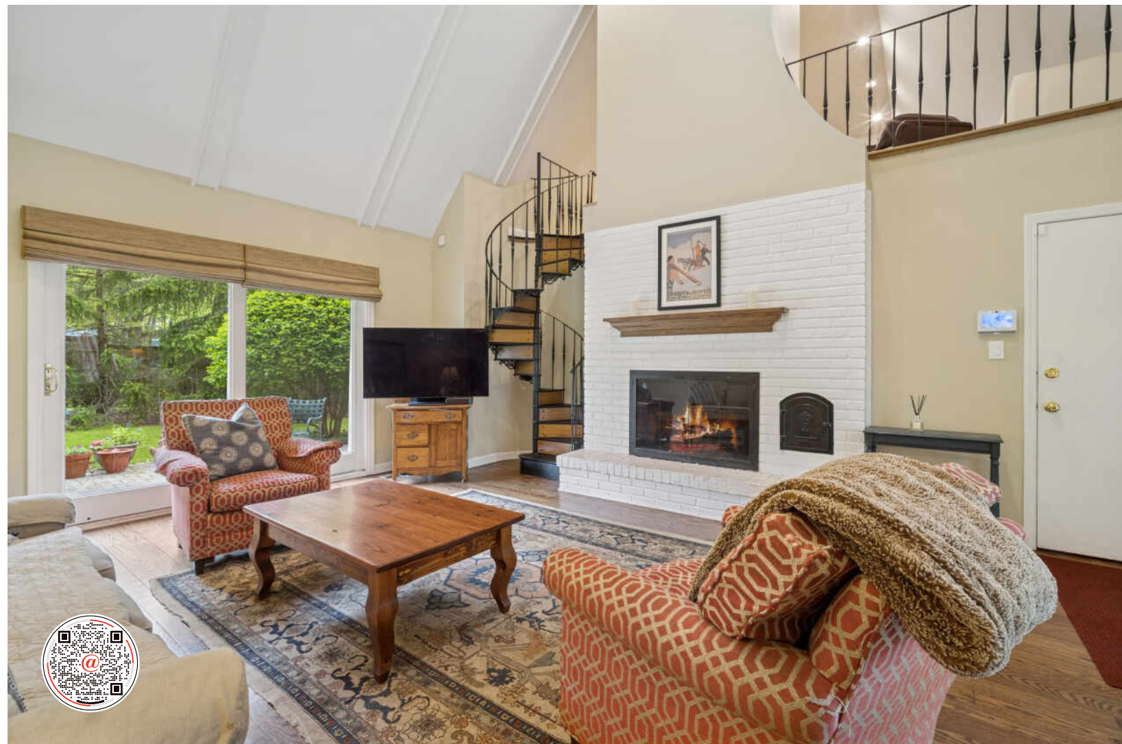
706 TANGLEWOOD COURT LAKE FOREST