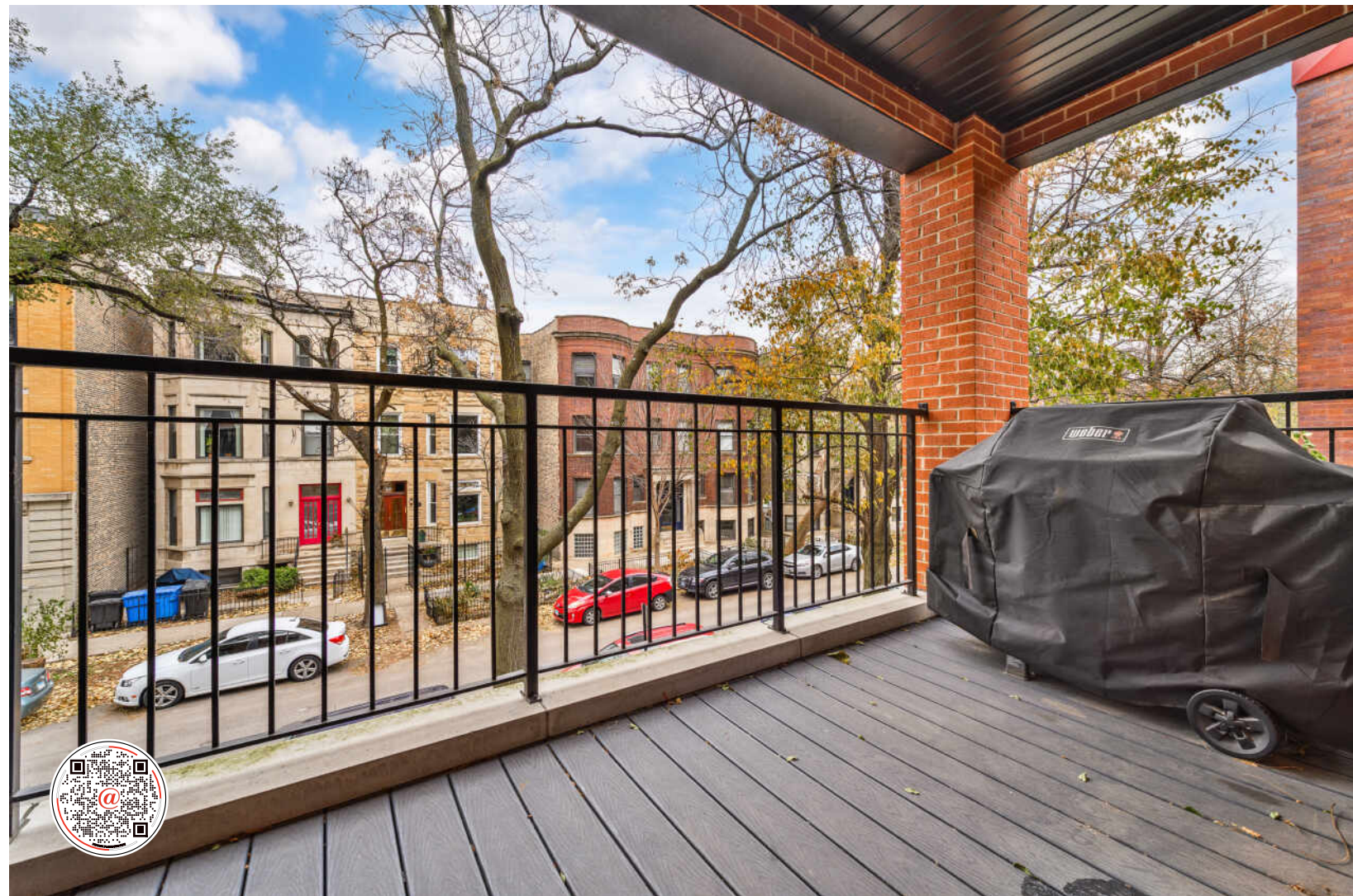
707 W BUCKINGHAM PLACE #2E LAKEVIEW