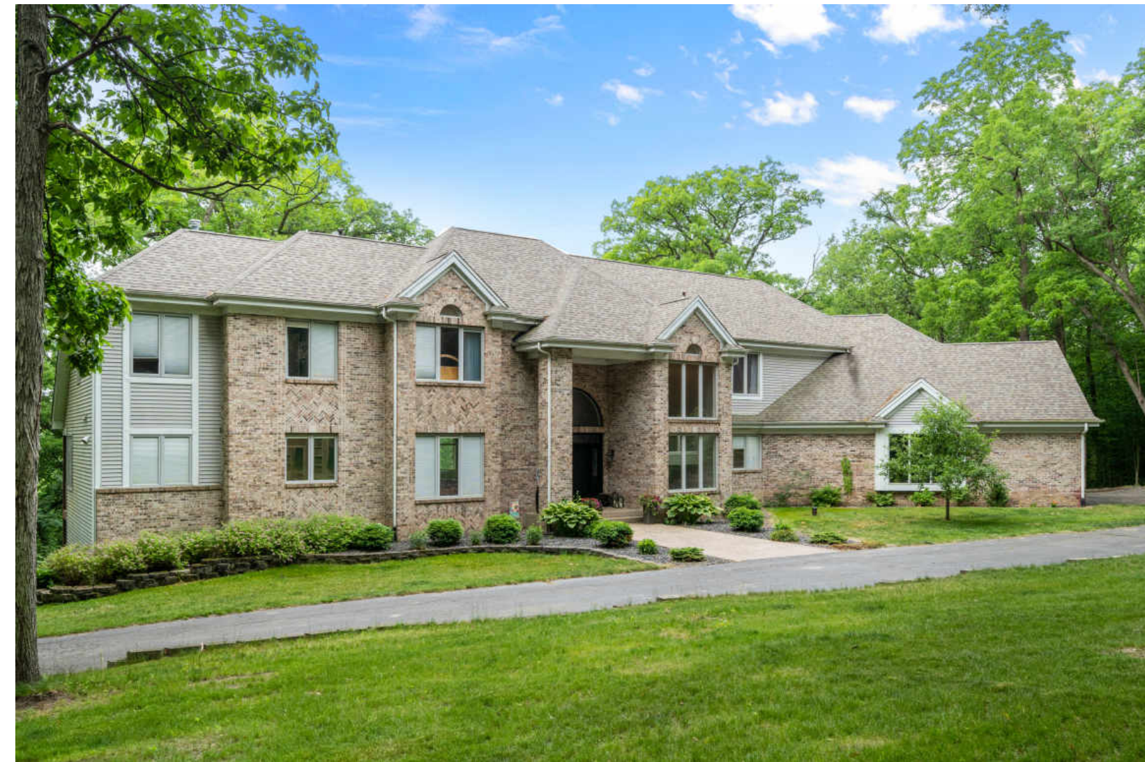
8102 BURR OAK ROAD ROSCOE