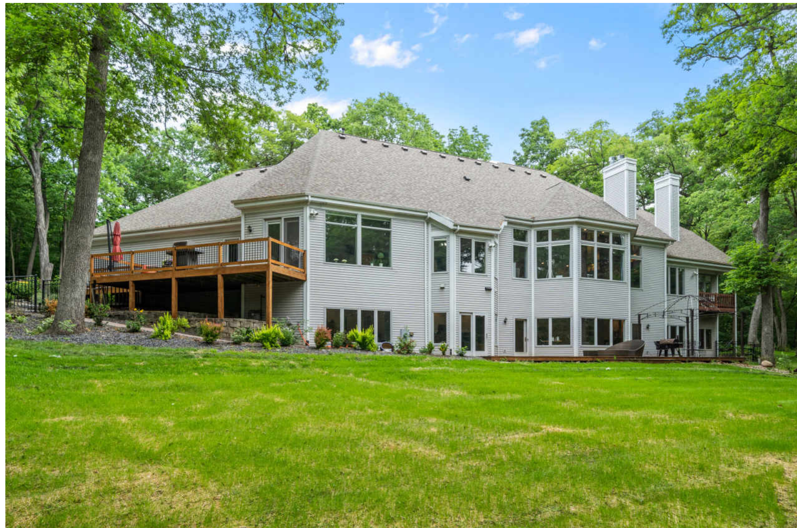
8102 BURR OAK ROAD ROSCOE