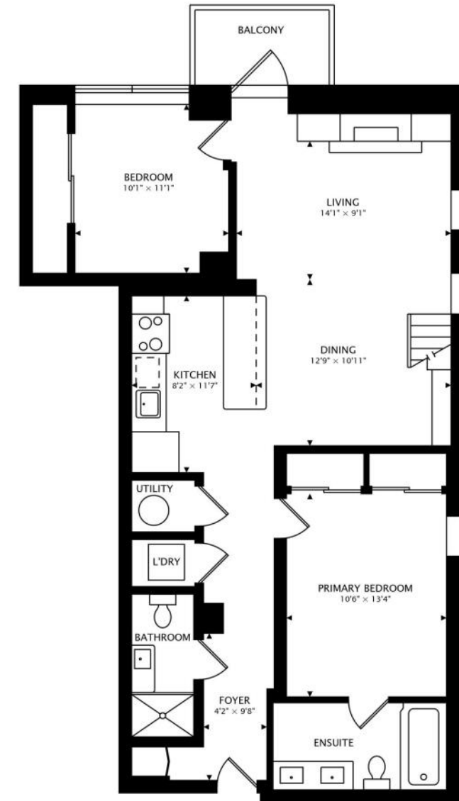
MAIN 1142 sq ft + 43 sq ft BALCONY