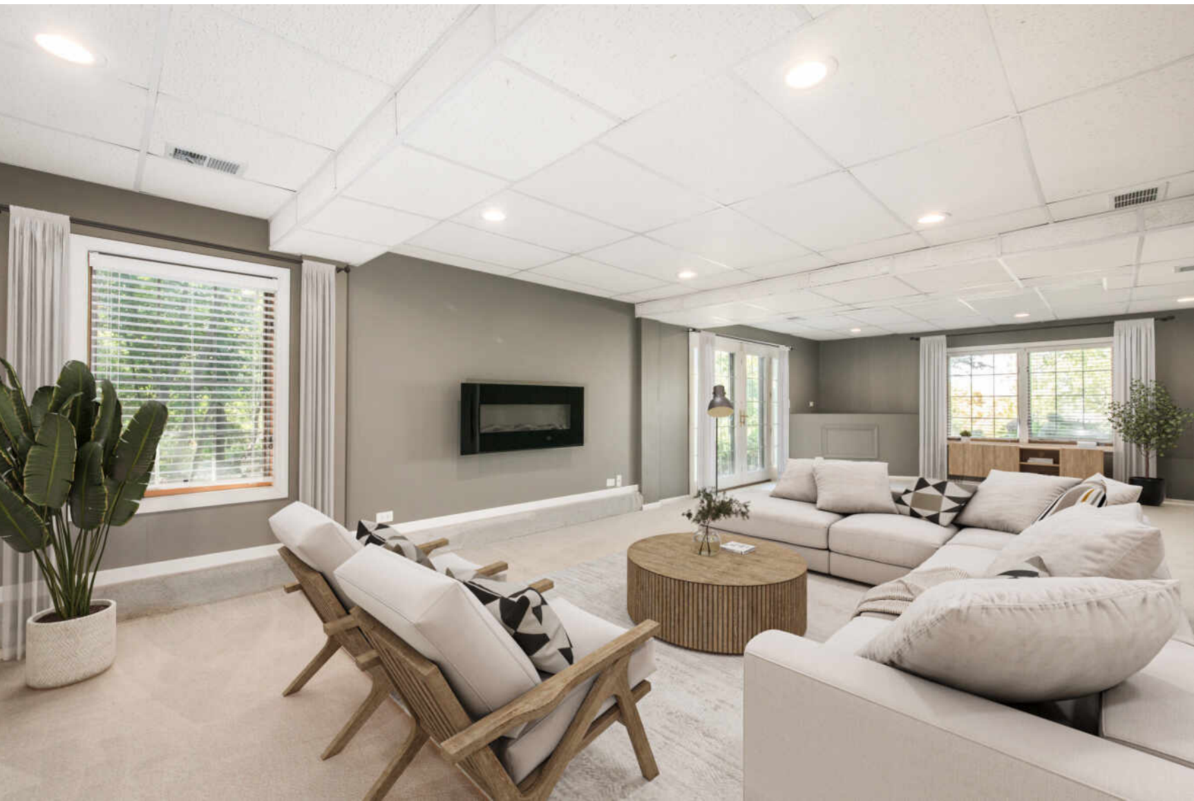
8 Division Ct. Lemont, IL