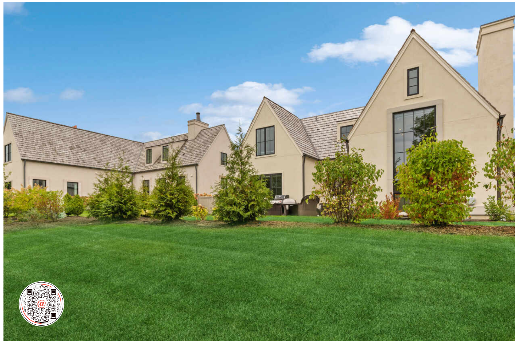
90 MORRIS LANE LAKE FOREST