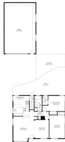
Floor Plan Created By Cubicoo App. Measurements Deemed Highly Reliable But Not Guaranteed.