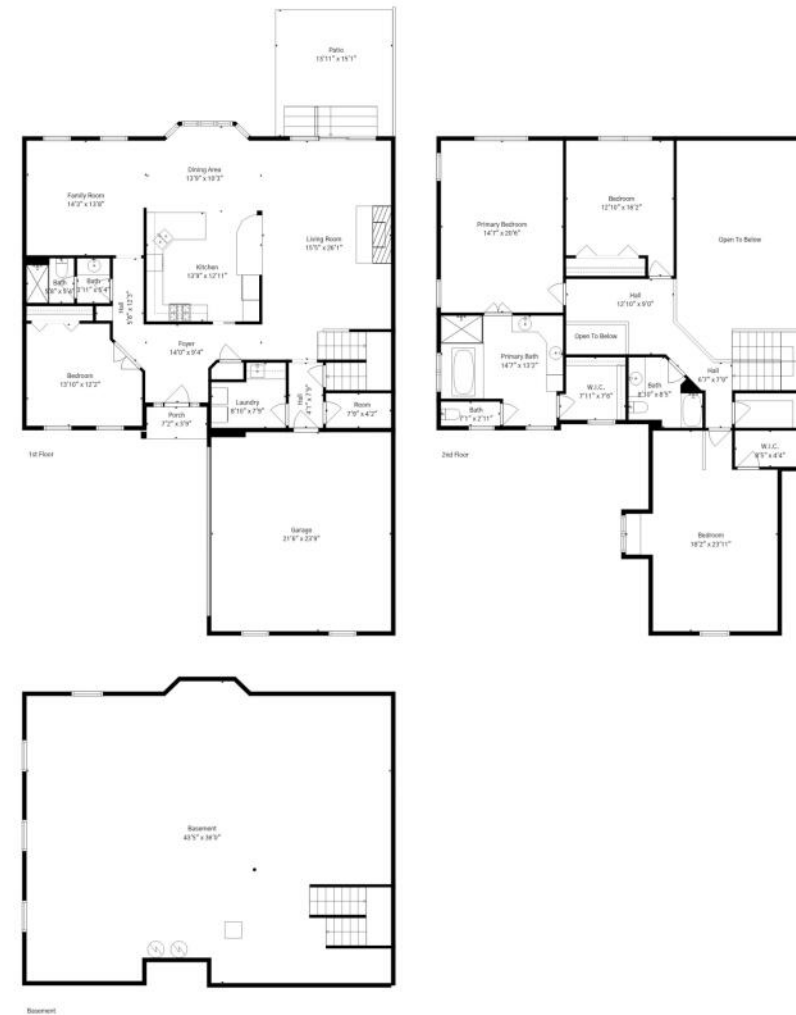
Floor Plan Created By Cubicasa App. Measurements Deemed Highly Reliable But Not Guaranteed.