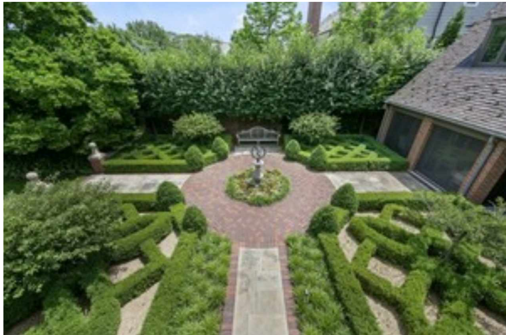
939 CLEVELAND ROAD HINSDALE