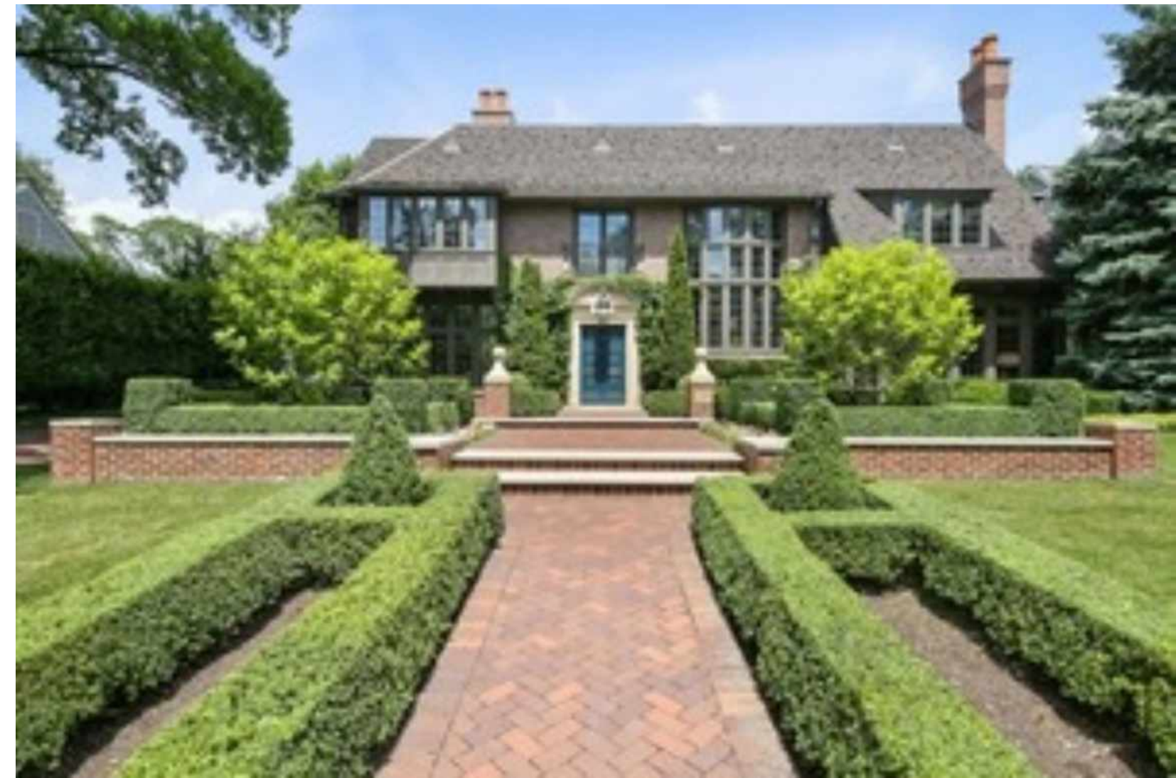
939 CLEVELAND ROAD HINSDALE