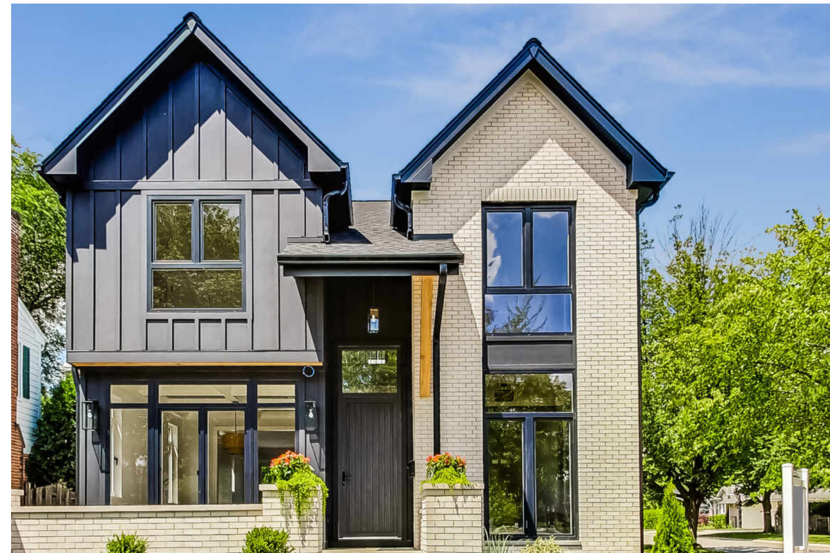
940 SPRUCE STREET • GLENVIEW

@properties | CHRISTIE'S INTERNATIONAL REAL ESTATE