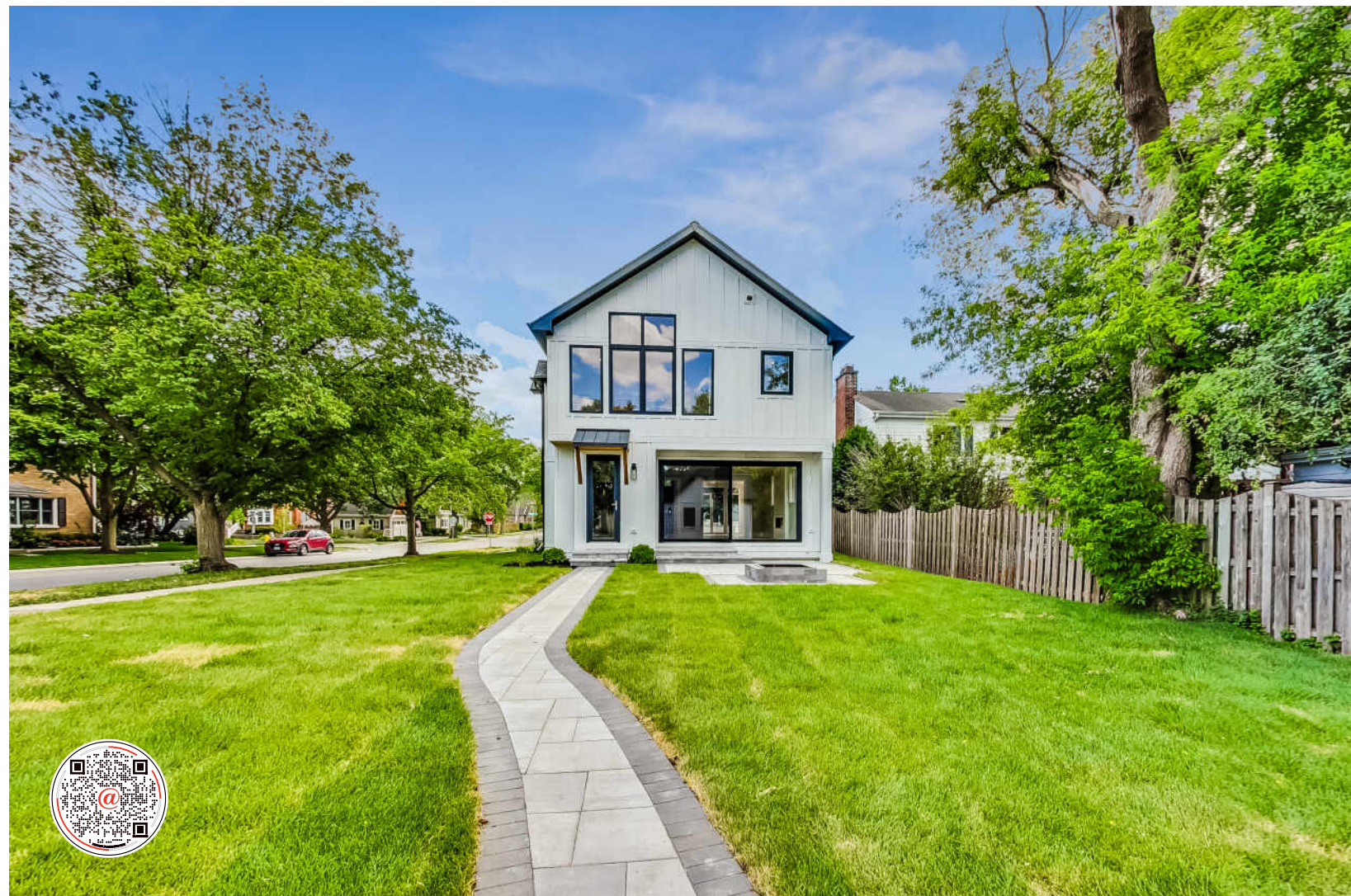
940 SPRUCE STREET GLENVIEW