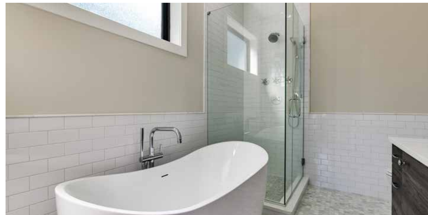
PRIMARY BEDROOM :: PRIMARY BATHROOM