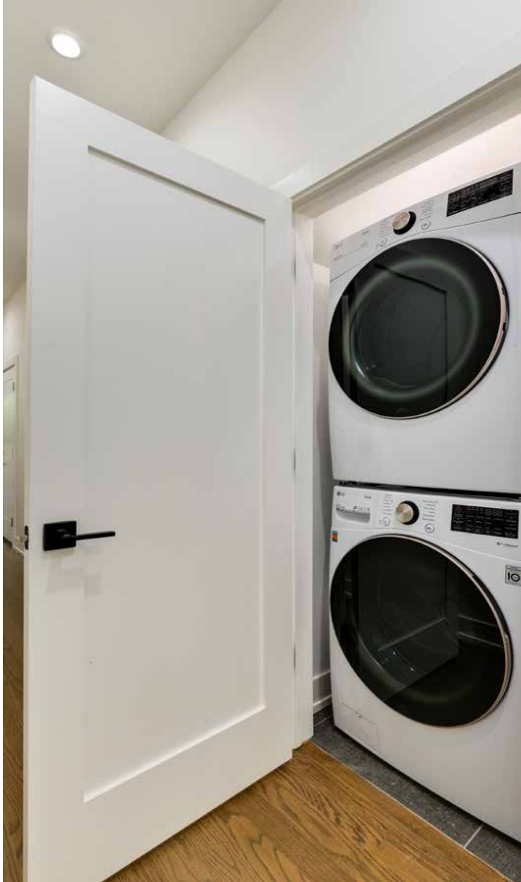
BEDROOM & BATHROOM :: LAUNDRY