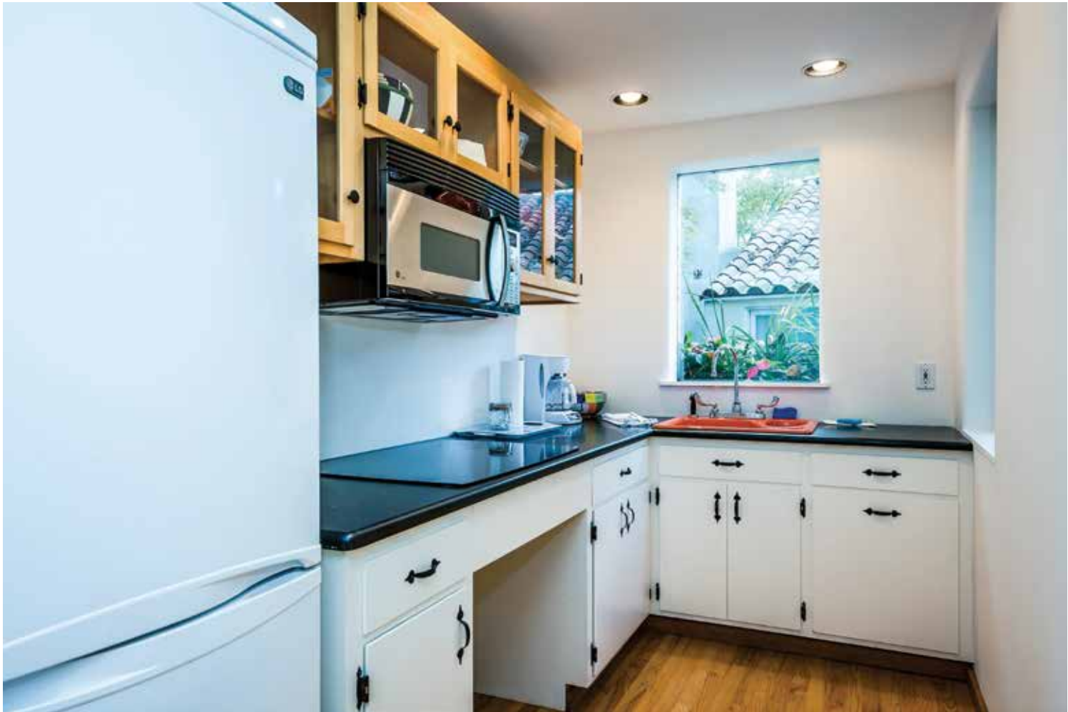
COACH HOUSE KITCHENETTE