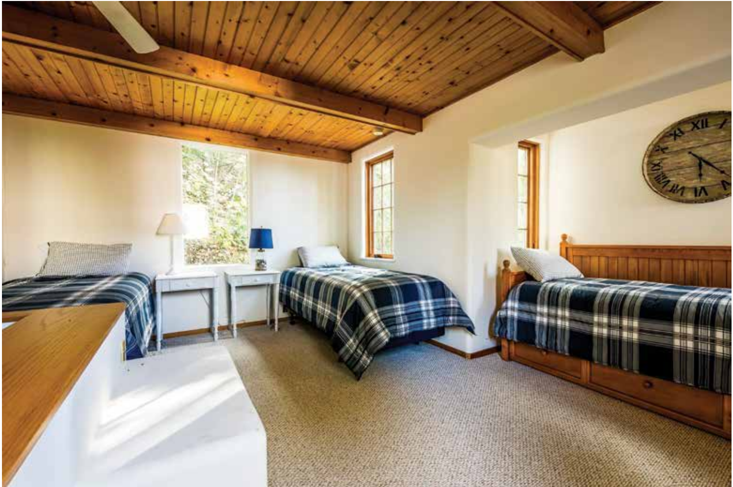
COACH HOUSE UPPER LEVEL BUNK AREA