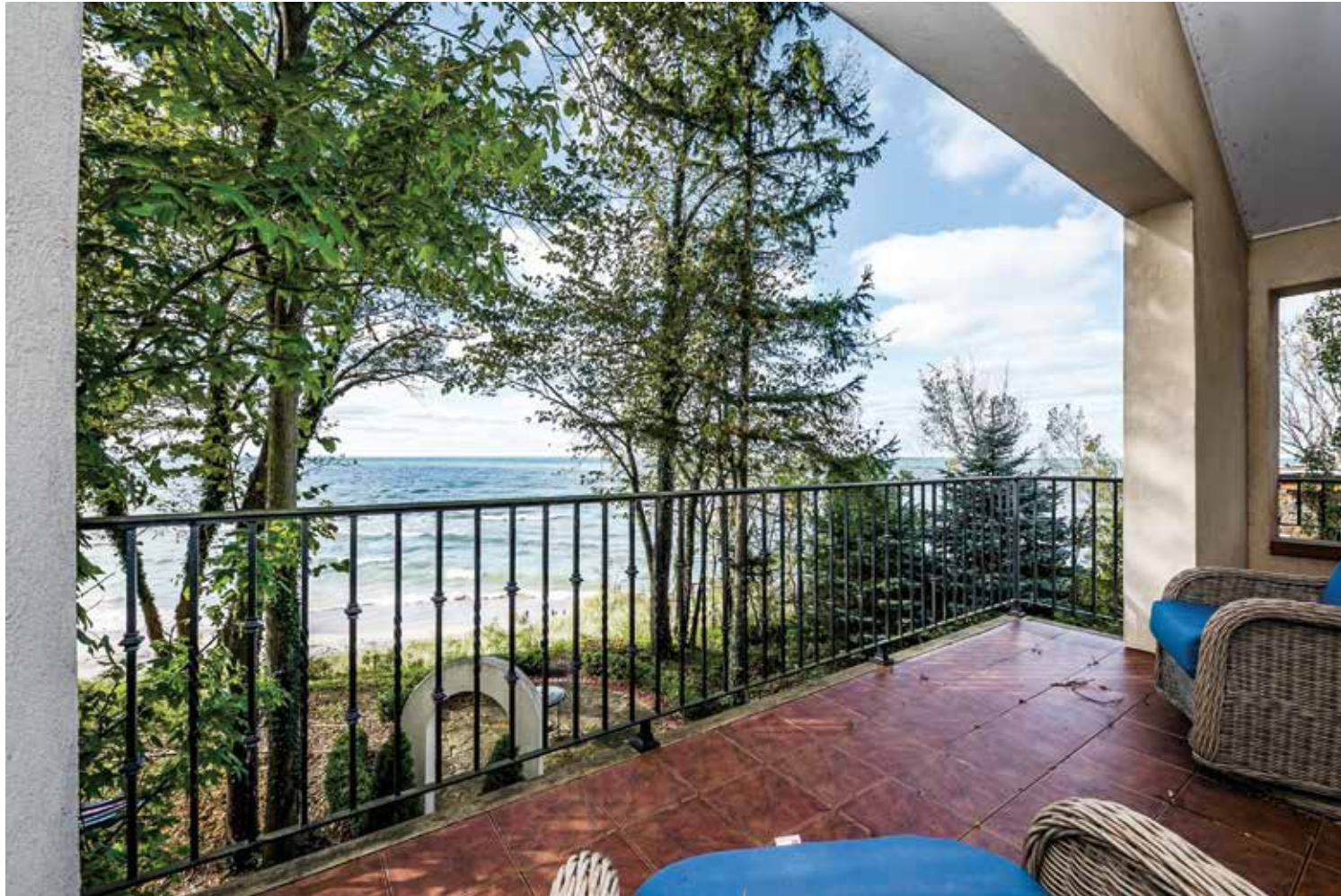
MASTER BEDROOM BALCONY