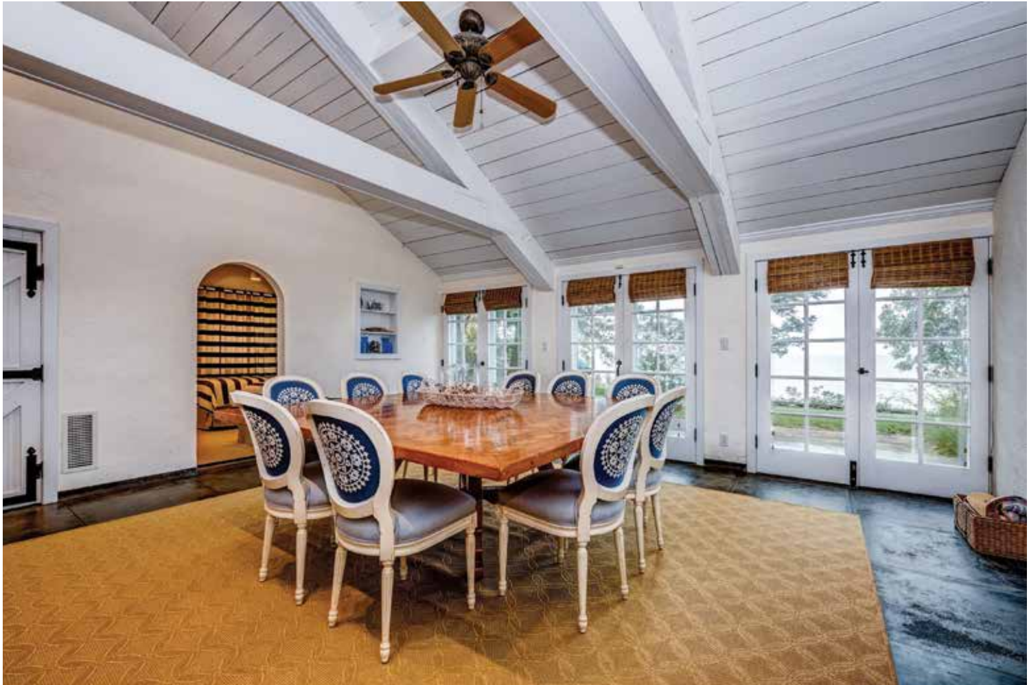
GREAT ROOM AND DINING AREA