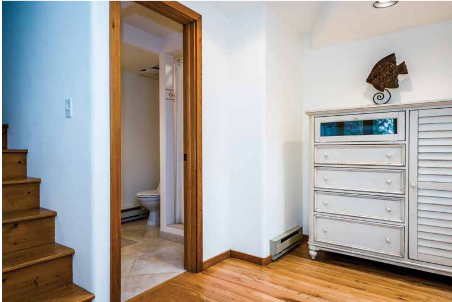
COACH HOUSE BEDROOM