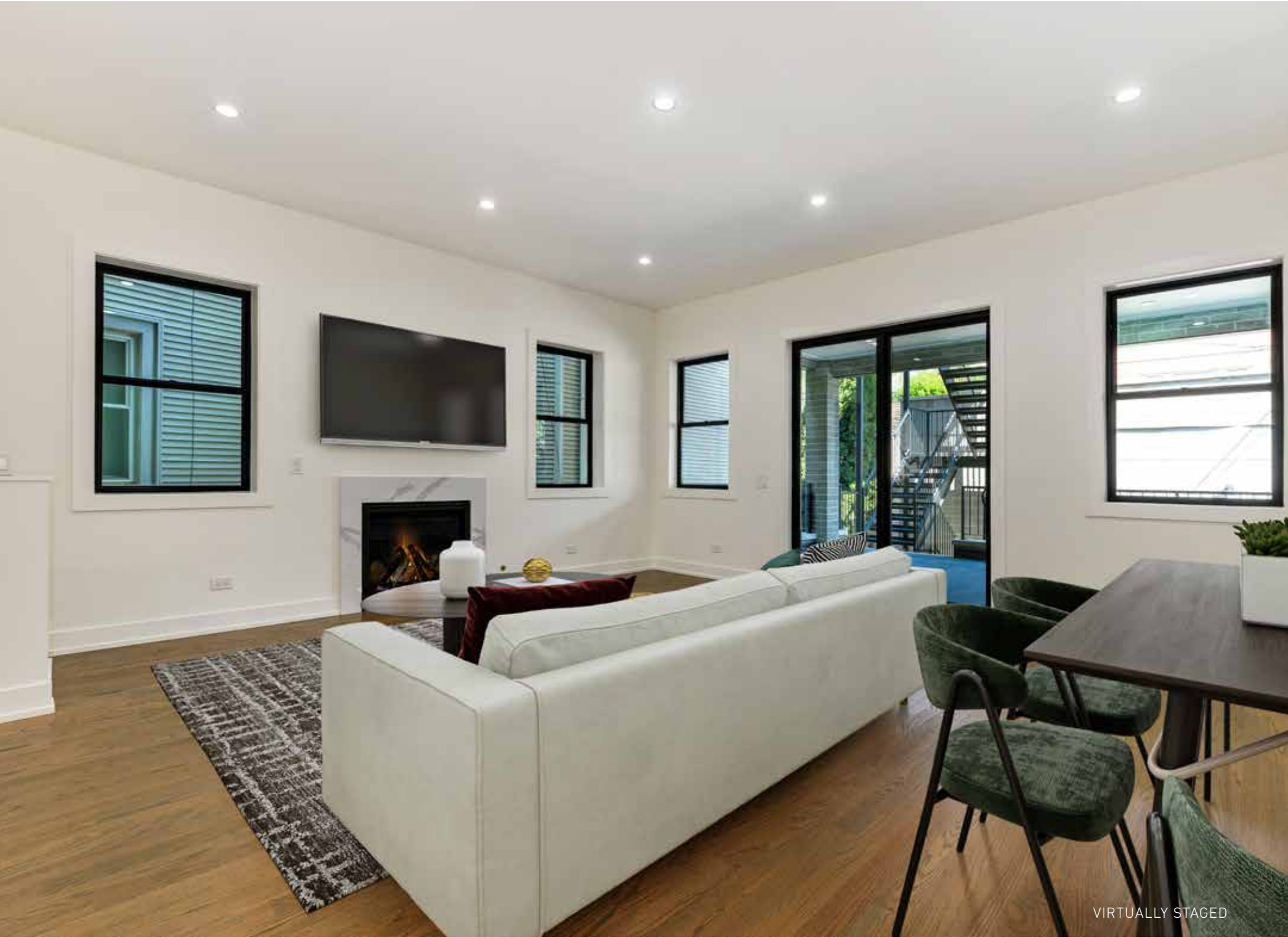
FAMILY ROOM :: POWDER ROOM