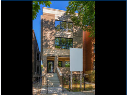
Some photos may be virtually staged