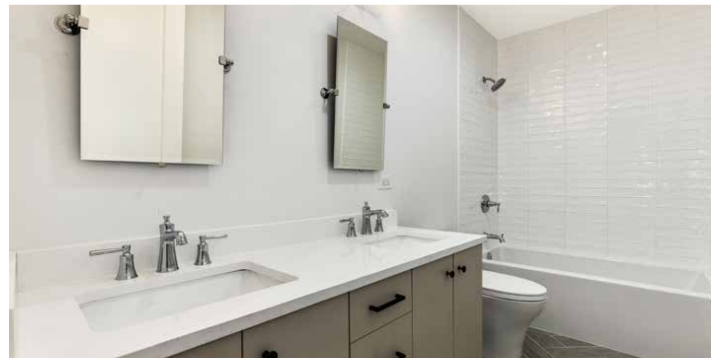
SECOND BEDROOM :: THIRD BEDROOM & BATHROOM